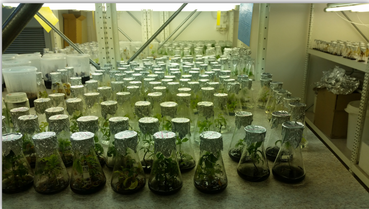
Figure 1: Growing of cuttings in Vukoz Institute Laboratory

The Vukoz Institute research facility has the additional benefit of being an indoor operation, enabling continuous, year round growing cycles. The Company anticipates treating over 1,400kg of medical cannabis biomass waste, which MGC Pharma estimates can be processed into 90kg of CBD extract per year.