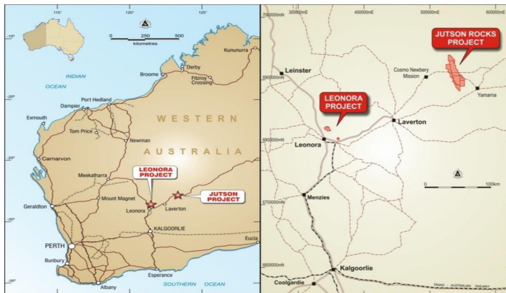
Figure 1 - Project Locations