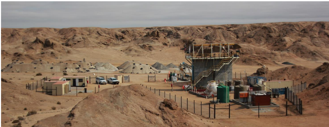
Figure 2 - Etango Project Demonstration Plant