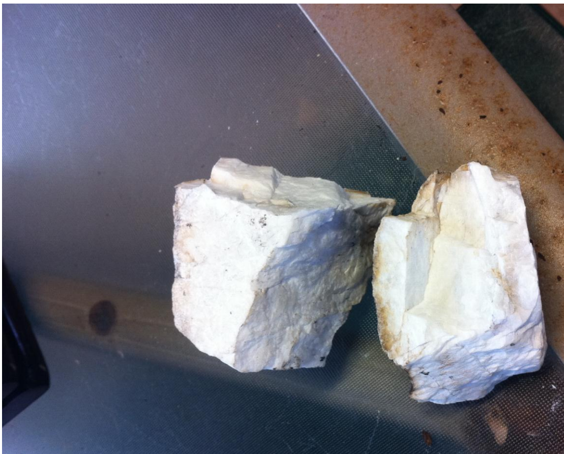
Plate 2: Sample of amblygonite from Litchfield Project from Tank Hill area (not assayed).