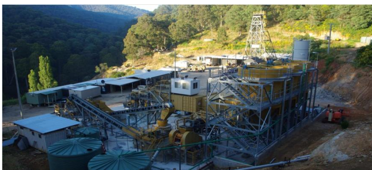
Mantle's Morning Star Gold Mine

The Norton Gold Mine is one of two flagship projects for Mantle and is projected to provide a strong foundation cash flow upon which to base substantial future growth.