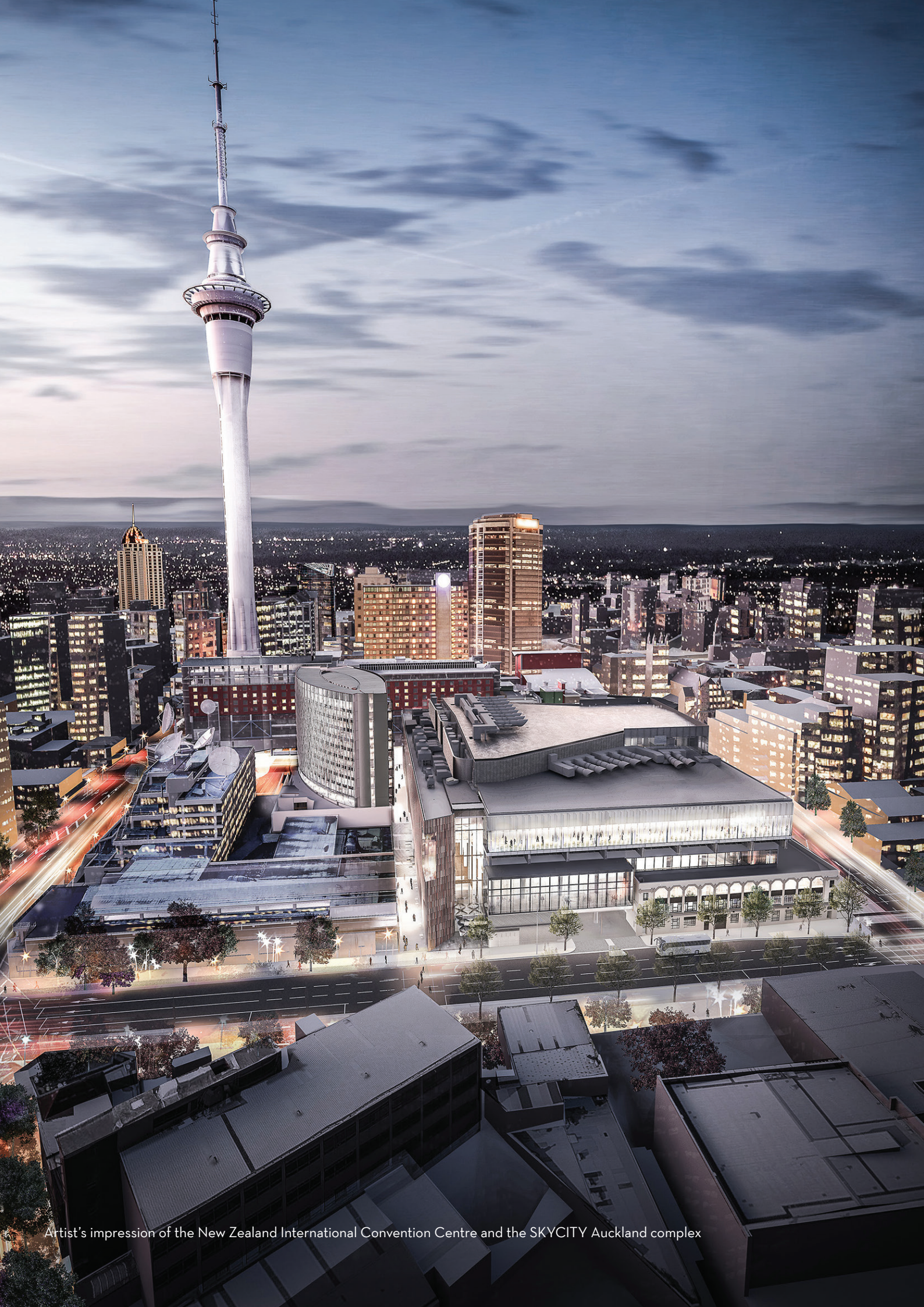
Artist's impression of the New Zealand International Convention Centre and the SKYCITY Auckland complex