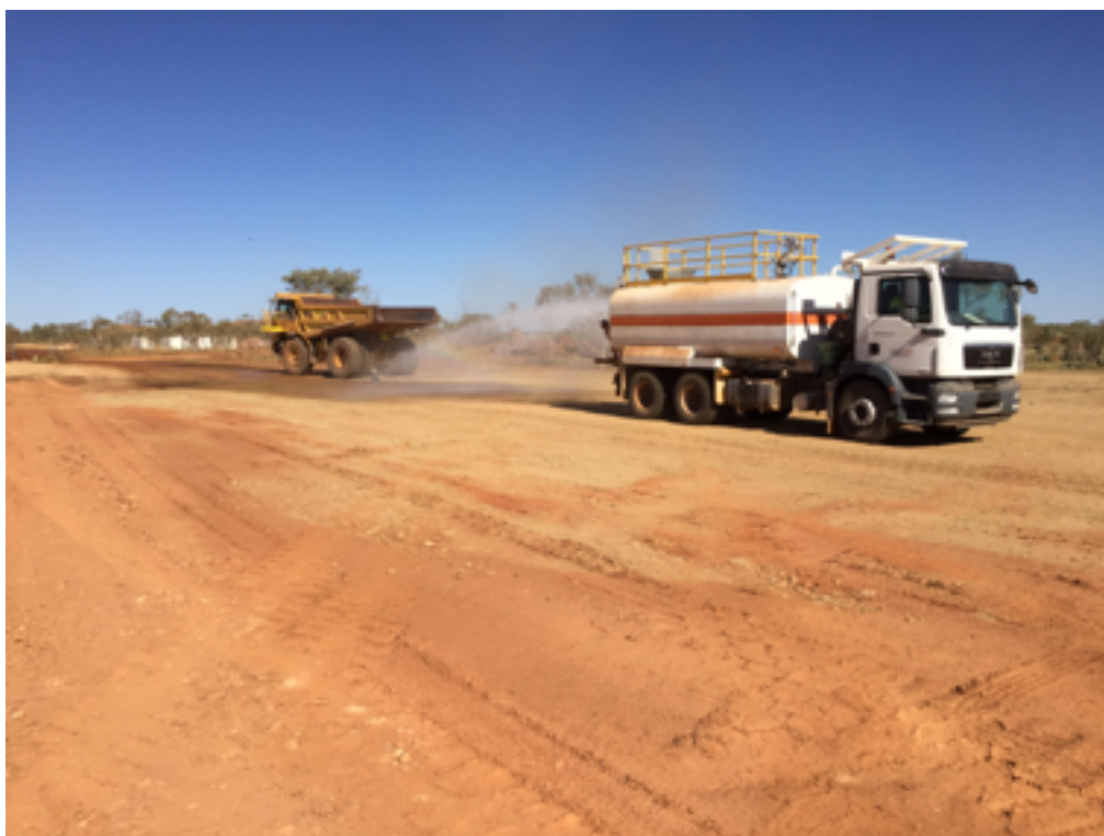
Preparatory Works Begin at Site.

The open pit mining contractors have mobilised to site, and preparatory site works are underway. It is expected that mining will commence in October 2016 as planned, and that ore will be delivered to the processing plant in the first half of the December 2016 quarter. The open pits have an initial life of 9 months, with ore to be blended with underground feed over a period of approximately 16 months.