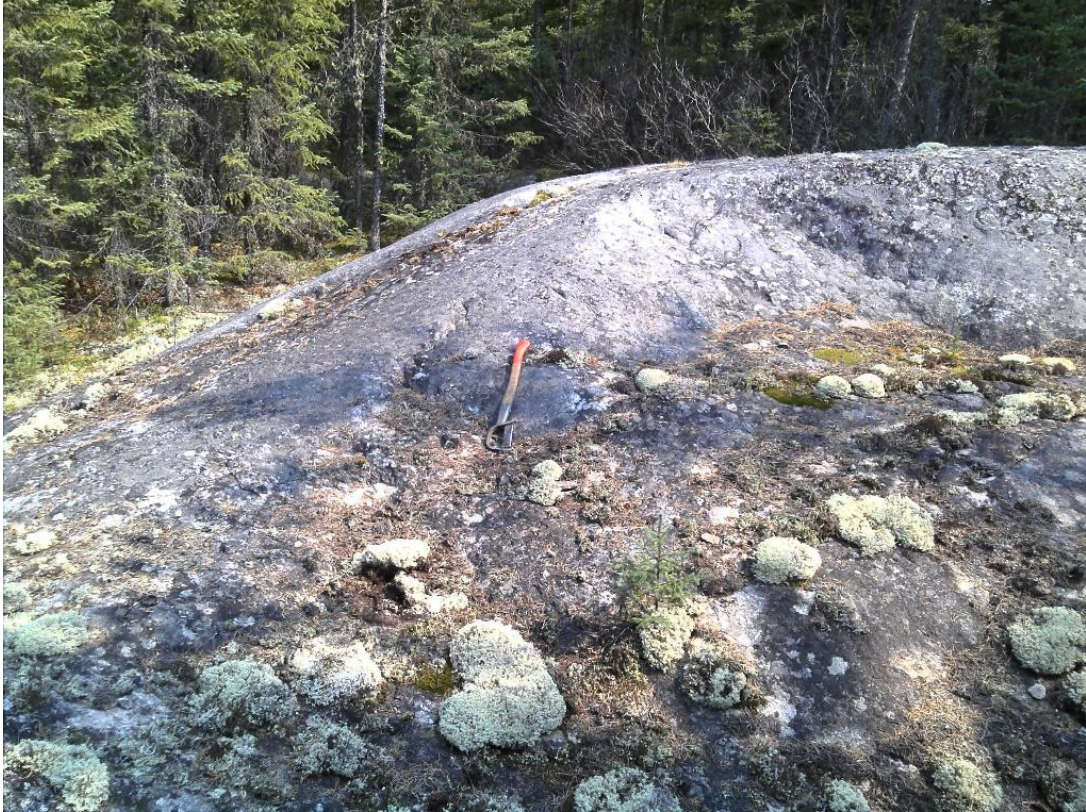
Figure 1: Photo of large pegmatite outcrop north of planned drilling locations at the McCombe pegmatite.

The Root Lake Project is accessible via local logging roads north of Sioux Lookout and is located approximately 300km north-west of Thunder Bay, a leading mining jurisdiction in Ontario with key local infrastructure including a skilled mining workforce and excellent local logistics and infrastructure. It has strong potential to provide high quality product to supply growing North American demand and export markets.