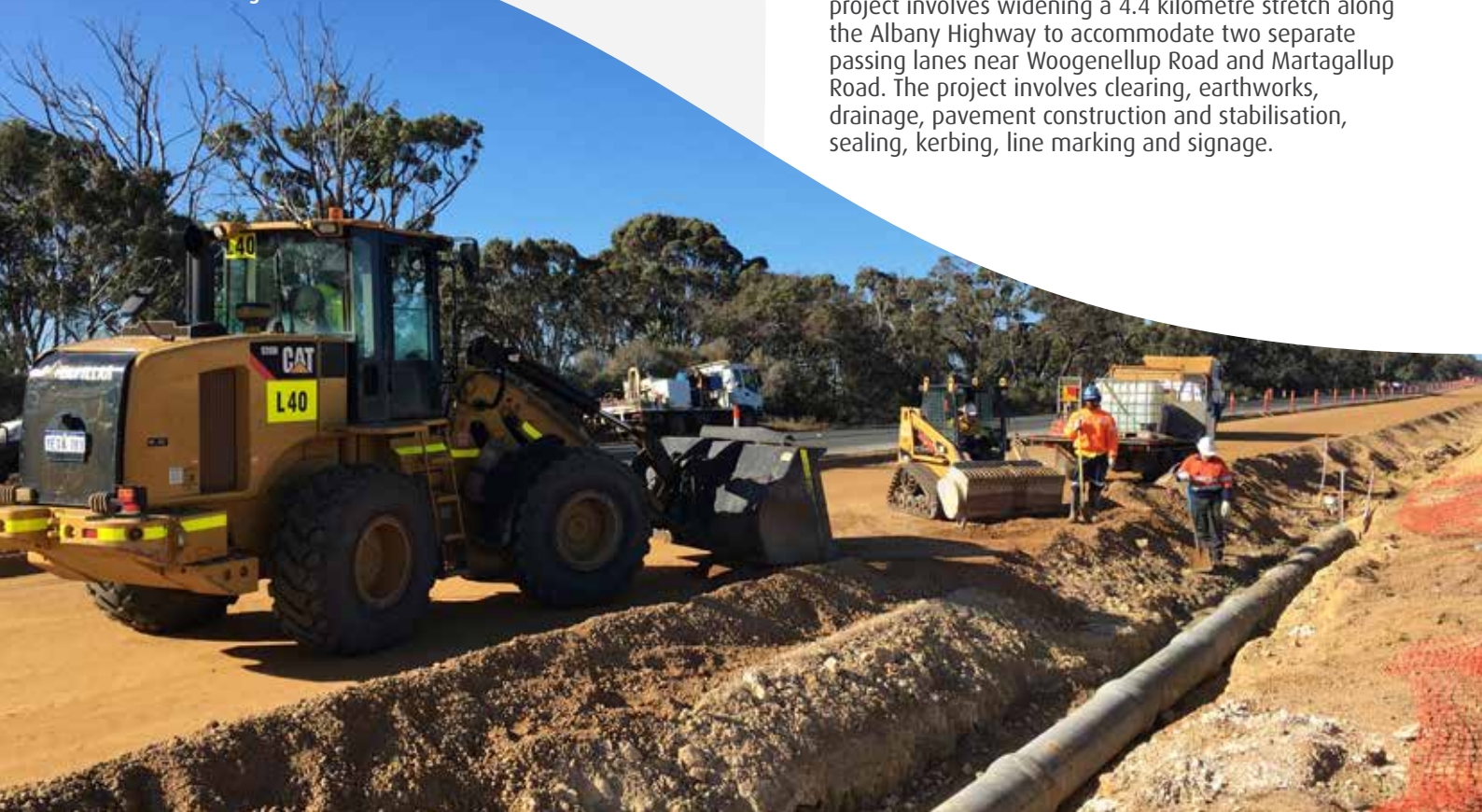
Albany Highway Widening, Mount Barker Passing Lanes

Watpac has been awarded a contract by Main Roads Western Australia to deliver the Mount Barker Passing Lanes project. Located in the Shire of Plantagenet, the project involves widening a 4.4 kilometre stretch along the Albany Highway to accommodate two separate passing lanes near Woogenellup Road and Martagallup Road. The project involves clearing, earthworks, drainage, pavement construction and stabilisation, sealing, kerbing, line marking and signage.