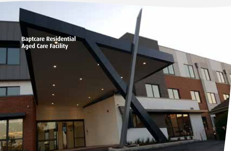
Baptcare Residential Aged Care Facility