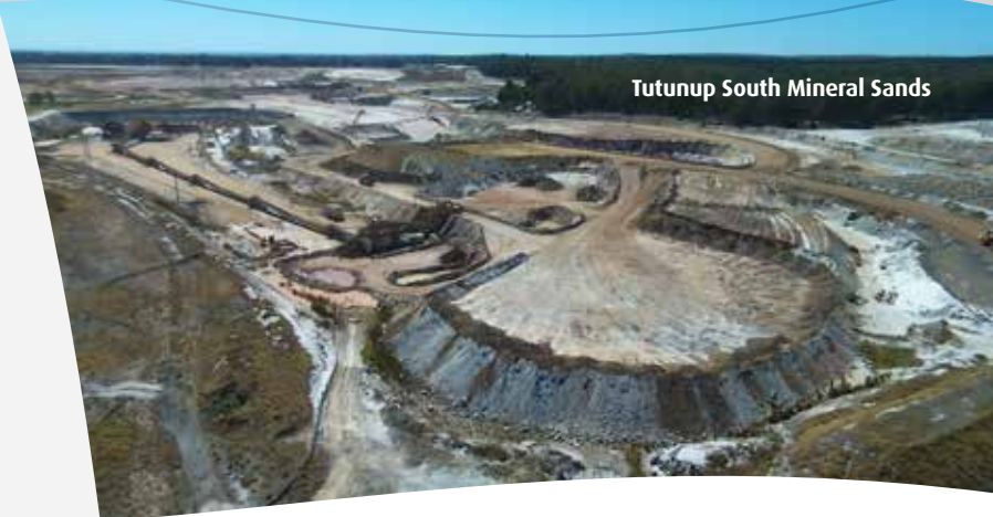
Tutunup South Mineral Sands

Watpac was awarded a $38 million contract with Silver Lake Resources in March 2016 to provide mining services at its Imperial/Majestic Project site, approximately 50 kilometres east of Kalgoorlie. The project involves establishing a gold mine at the greenfield site and mining of the Imperial and Majestic pits over a 25-month period using excavators and dump trucks. The team have completed clear and grub of vegetation as well as removal of topsoil from the Imperial Pit using scrapers. Workshop and office facilities have also been constructed on site.