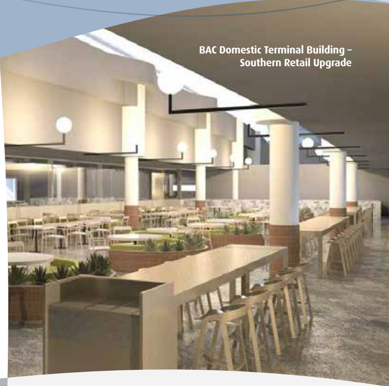
BAC Domestic Terminal Building – Southern Retail Upgrade