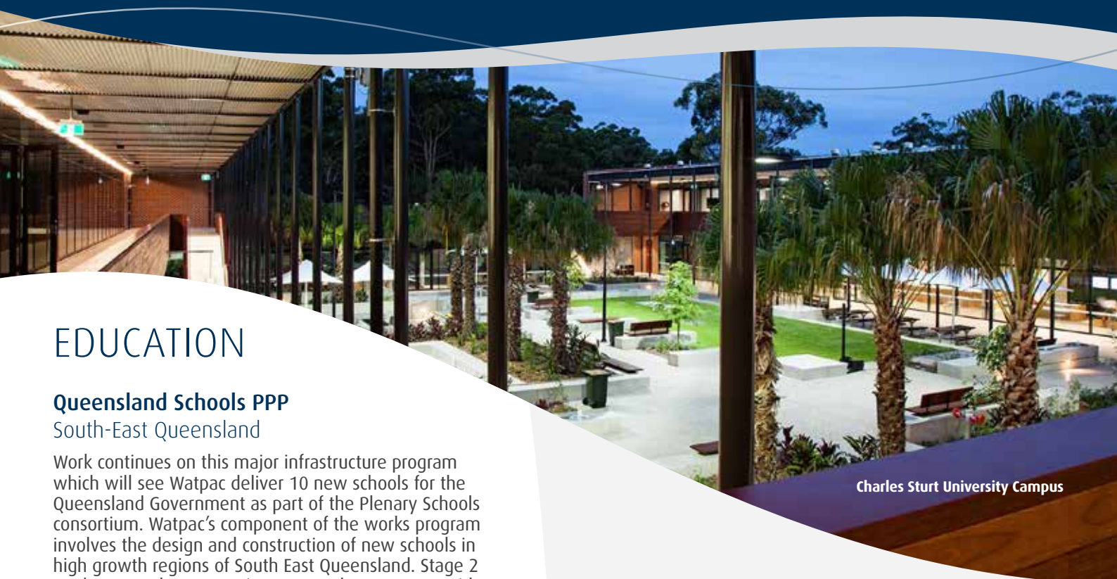
Charles Sturt University Campus

This project has focused on the construction of a 190-seat theatre, a large performance stage and a three-storey Year 7 Centre. Watpac is also delivering a new entry forecourt as part of the project. Located between existing College structures, the new complex has been designed to provide seamless interaction between old and new facilities, and encourage the use of different learning spaces.