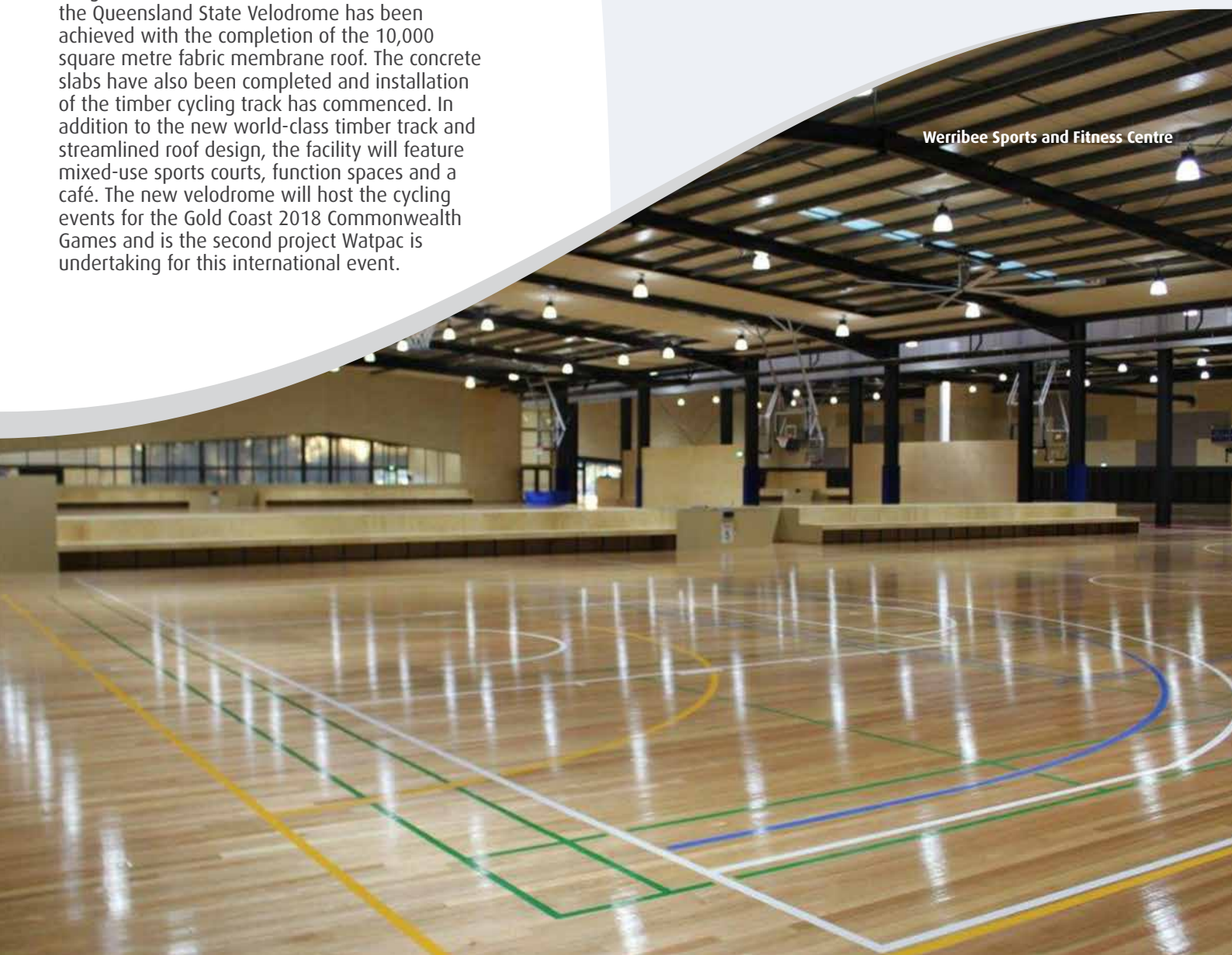
Werribee Sports and Fitness Centre

Watpac is delivering the two-stage design and construct contract for the new aquatic centre, part of the ongoing facility and amenity expansion at the Gold Coast university campus. The centre will comprise a FINA accredited 50 metre swimming pool and fitness-oriented facility. It will play a vital role in the education of students, providing a state-of-the-art facility that supports teaching and research across a range of disciplines. The new centre will enable Griffith University to host community, regional, state and national sporting competitions, and will be well-utilised as a training facility for the Gold Coast 2018 Commonwealth Games.