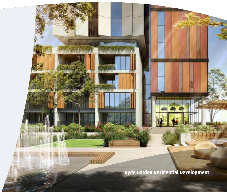
Ryde Garden Residential Development

On site works have commenced at the Ryde Garden residential development in North Ryde, following finalisation of the construction contract in April 2016. The development features 830 residential apartments, basement parking for 730 cars, rooftop gardens, a communal pool and 2,100 square metres of public park. In addition, the Ryde Garden project will provide 1,100 square metres of non-residential floor space including retail space, gymnasium and an area dedicated for a future child care centre.