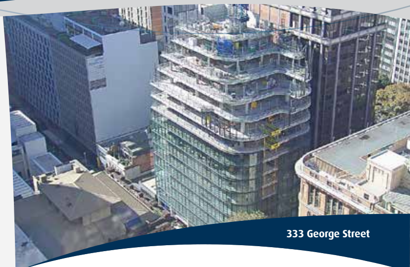
333 George Street

Construction is progressing on the 18-storey premium office tower Watpac is delivering for Charter Hall Group's wholesale managed fund, Core Plus Office Fund. The concrete structure has been completed with the façade nearing completion. Works are currently focused on the removal of temporary hoists, progressing fitout and commissioning activities. When complete the tower will feature 15 levels of A-Grade commercial space, three levels of premium retail, landscaped rooftop terraces and basement parking.