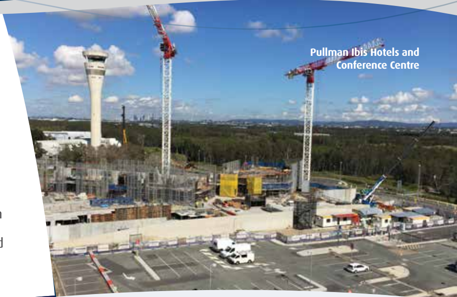
Pullman Ibis Hotels and Conference Centre

Construction of the new 5-star Pullman Hotel, 3.5-star Ibis Hotel and Conference Centre at Brisbane Airport continues to progress with all basement concrete slabs now complete. The first suspended tower slabs for both hotels have also been completed, with forming of the Level 1 transfer slab underway. Work on the façade panelling is anticipated to commence this month, with construction of the concrete structure expected to be completed in September 2016.