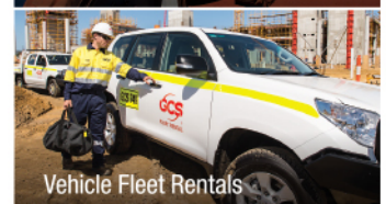
Vehicle Fleet Rentals