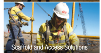
Scaffold and Access Solutions