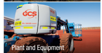
Plant and Equipment