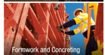
Formwork and Concreting