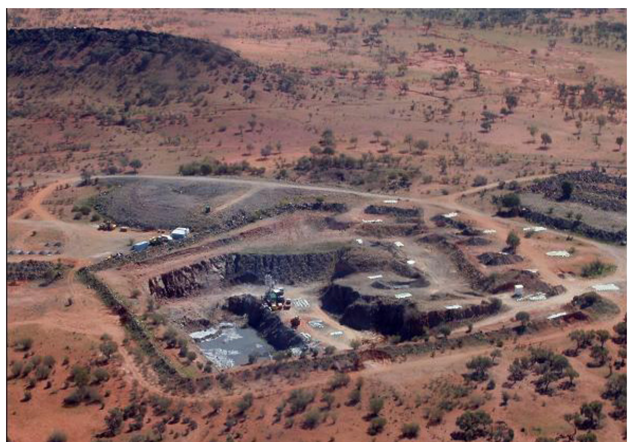
Figure 2: Molyhil Open Pit