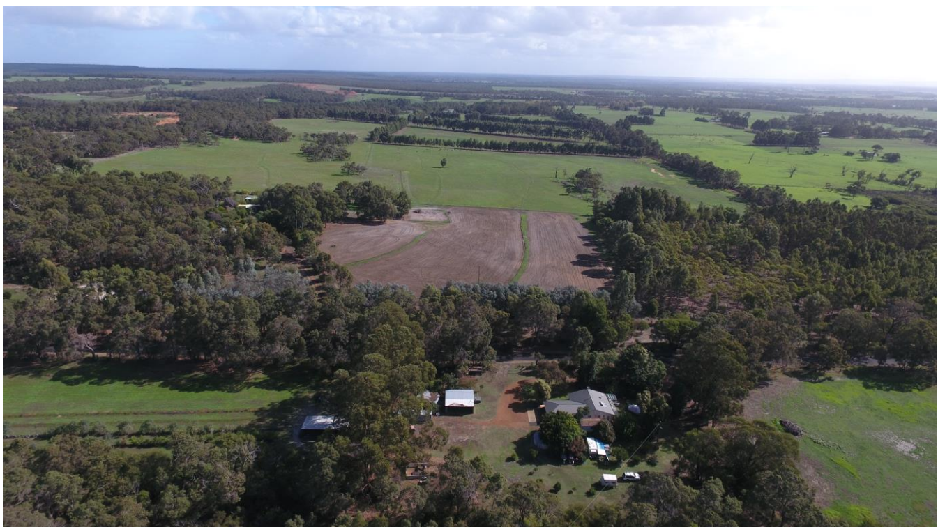
Figure 2. Location of Busselton agricultural property, site of first CellCube battery installation in WA.

“Working with Sun Connect and Western Power, we will bed down the installation and connection of the PV system and the CellCube to the grid. We will use our new knowledge to highlight the benefits that large flow battery systems can offer commercial customers, as well as the utilities, throughout Australia.”