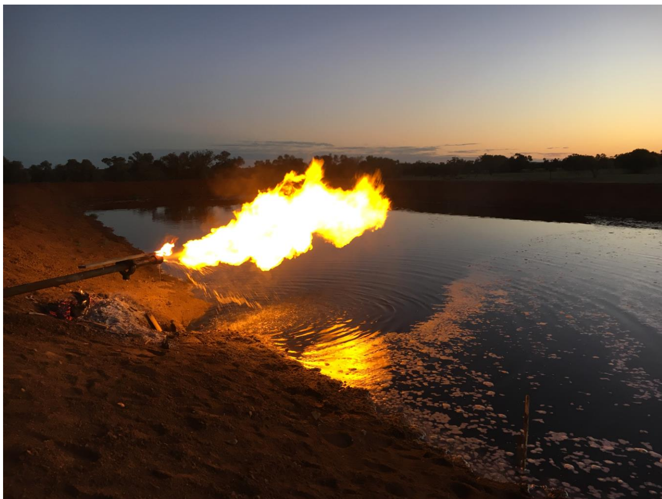
Figure 1: Gas flare and water flow during the flowback at the Tamarama-1 well in South West Queensland