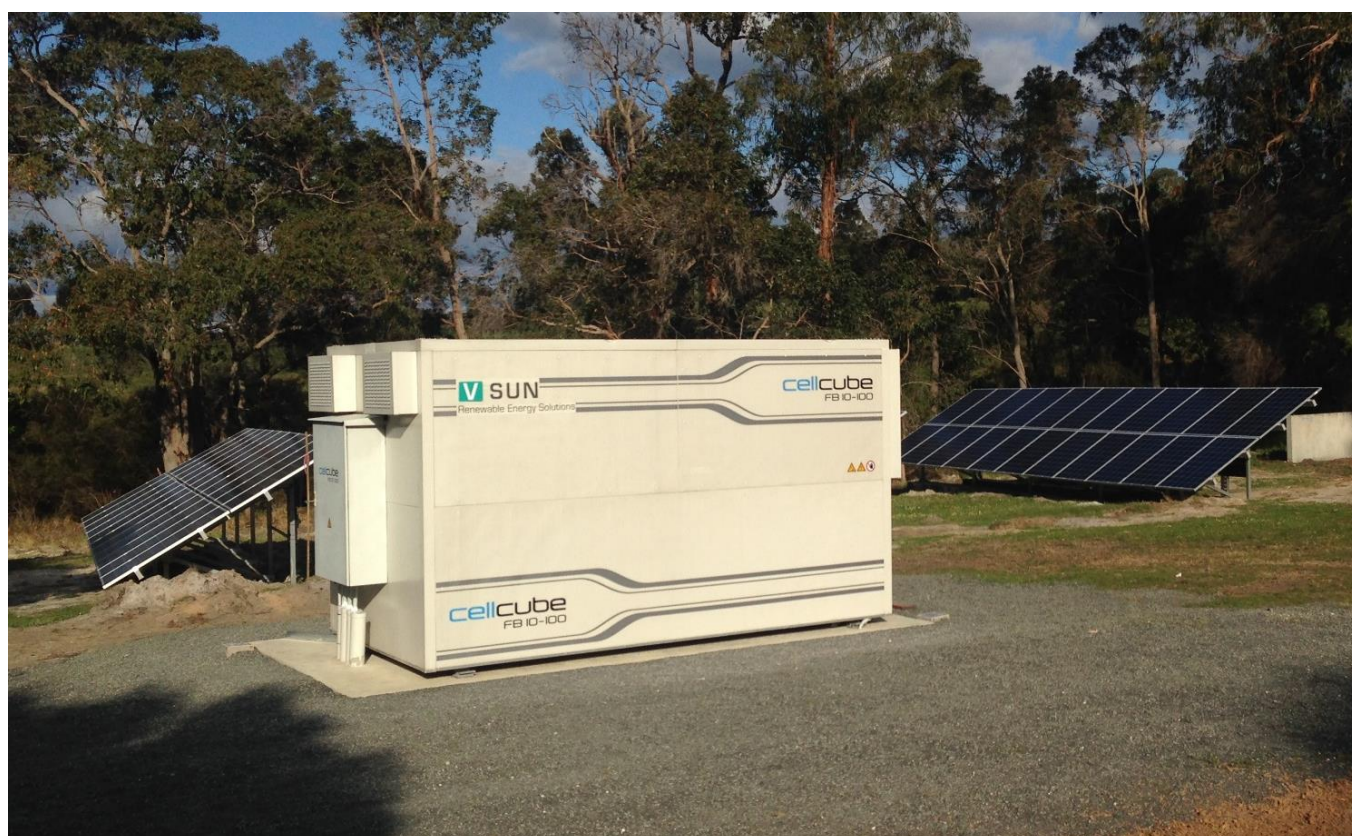
Figure 1 – CellCube and solar PV panel array installed at a rural property in south Western Australia.

Installation of the first CellCube VRFB system provides the Company with an opportunity to showcase the technology to potential customers in a typical Australian rural application (see Figure 1).