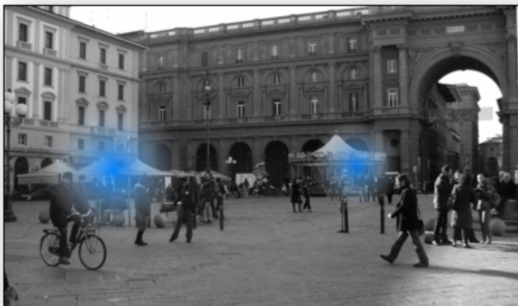
Augmented Reality view "frequency scales" the Wi-Fi signal, aiding nearby access point visibility

World Wi-Fi features a simple, easy to use "Wi-Fi Search" interface, intuitive enough for people of all ages to use. The interface is based on making "the invisible" (i.e. the wireless signal), visible for the first time with a patent-pending approach to "translate" the (invisible) Wi-Fi signal into the visible part of the electromagnetic spectrum, preserving other physics-based aspects to maximise realism of the view presented to the end-user.