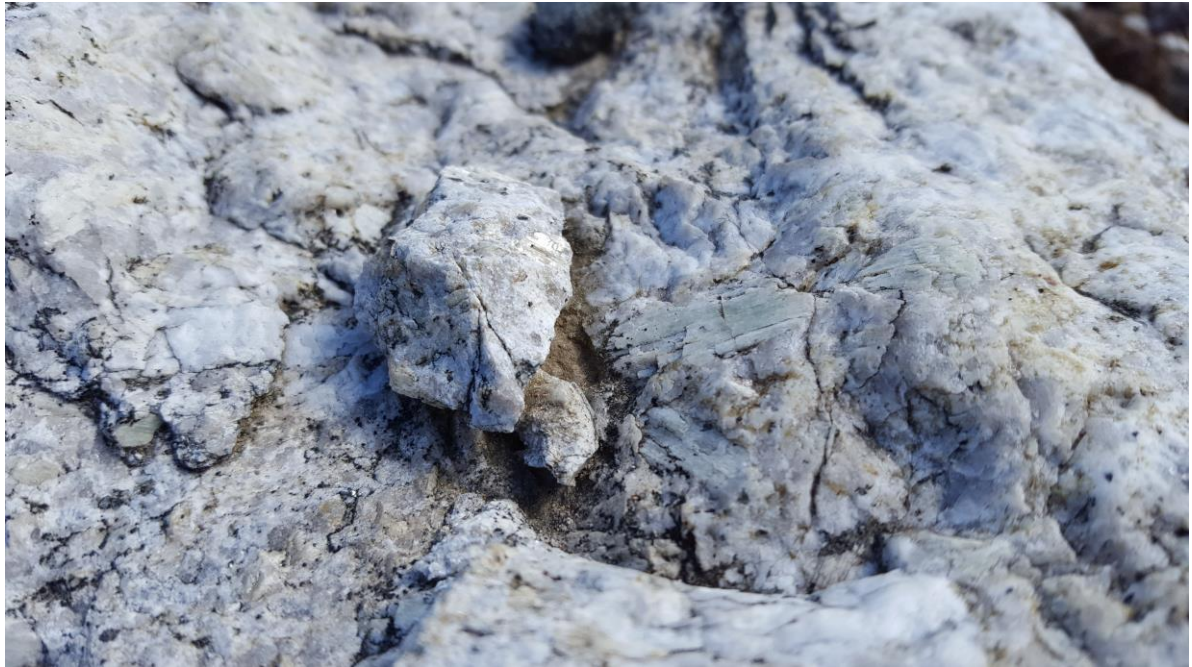
Figure 3. Example of Spodumene crystal in the Root Bay pegmatite exposure.

Ardiden's geological team cut a 15m channel across the surface of the outcropping pegmatite, collecting 15 samples which were each 1 metre long. The channel samples were logged and sent to Actlabs laboratory in Thunder Bay for analysis under QAQC procedures.