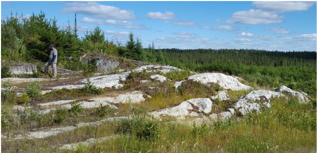
Figure 2. Photo of the Root Bay pegmatite exposure.

The outcrop distribution of the pegmatite indicates that the spodumene dyke is perhaps 10m wide at this location along the limited, exposed contact of approximately 60m.