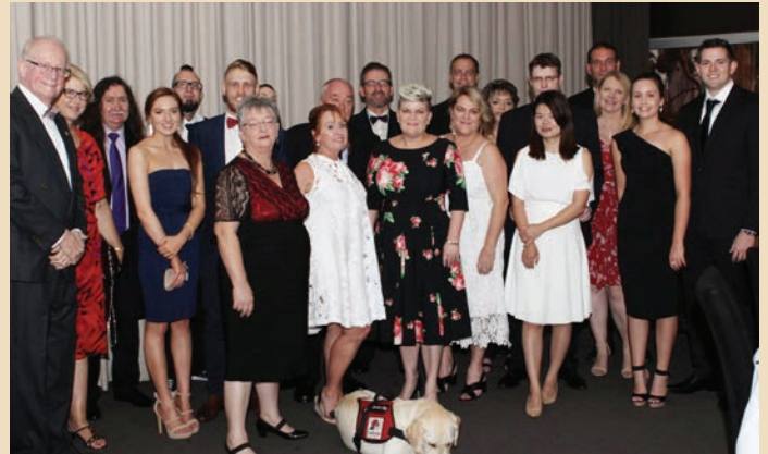
Staff and Board members attending the Smart Pups Gala Dinner.

Board members, staff and friends enjoyed the evening which was informative and at the same time tugged at the heart strings with past families speaking of their experiences over the last