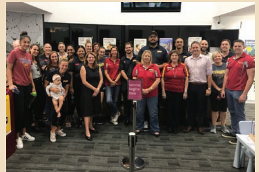
Junior team members receiving their gift.

Looking to play basketball socially or competitively? Contact the centre direct on 3801 3566 for further information.