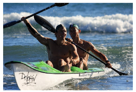
Club training at Taylors Mistake

Argosy is pleased to announce it recently approved funding to support expenditure for the clubs 2017/2018 Life Guard Provisions and First Aid Training and Supplies.