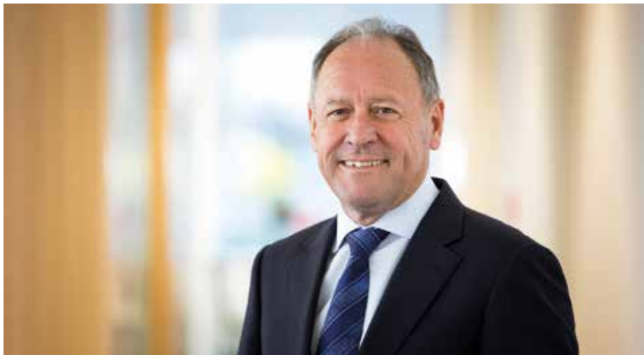
SIR RALPH NORRIS Chairman

Fletcher Building is a diversified building company, comprising more than 30 businesses with operations that span the entire building supply chain. The majority of these businesses are performing well, and are benefiting from supportive market conditions.