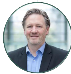
Chief Operating Officer