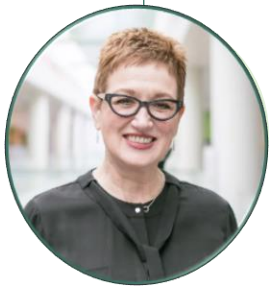
Chief People Officer