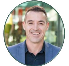
Chief Transformation Officer