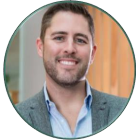
Chief Marketing Officer