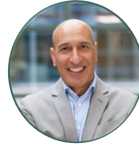
CEO The Warehouse & Warehouse Stationery