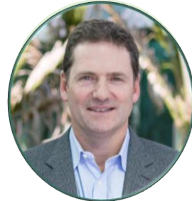
Chief Financial Officer