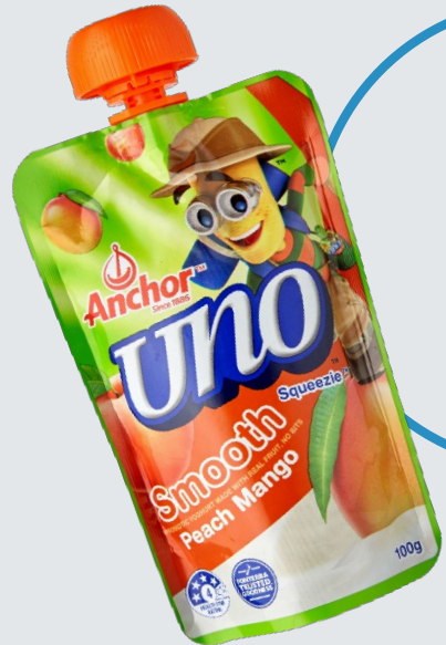
Reduced sugar in Kiwi kids' diets