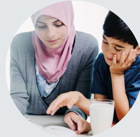
High Protein Instant Milk Powder 33% of an adult's daily calcium needs