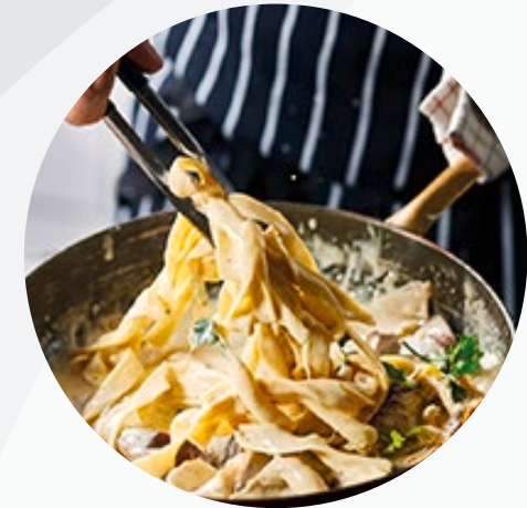
Anchor™ Food Professionals