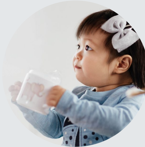
An infant formula inspired by breast milk