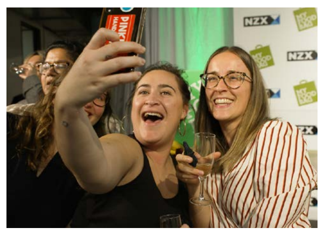
My Food Bag was one of four new companies to list on our Exchange in H1 2021, along with NZ Automotive Investments, Third Age Health and DGL Group.

Capital raised for the six months totalled $7.3 billion, down 10.6% on the same time last year. However, this is similar to the same period in 2019 and up 16.5% on the average levels over the past five years.