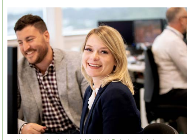
We have continued to invest in NZX Wealth Technologies' platform technology and staffing capability to onboard and service our growing client base.

We have signed contracts with three new large-scale clients and have onboarding underway with two of these, which we expect to increase FUA to around $10 billion by the end of 2021. We will continue to invest in technology and other resources to support the growth and operational