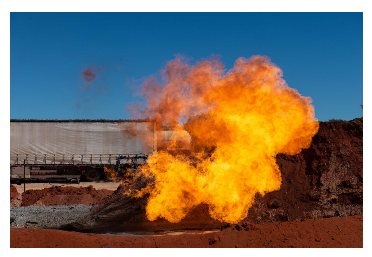
Figure 2: Upper Stairway flare while drilling