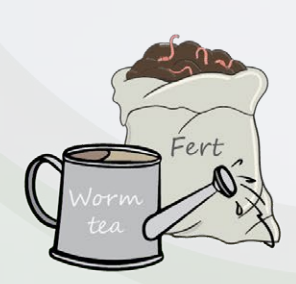
Worm castings and tea nutrients for gardens