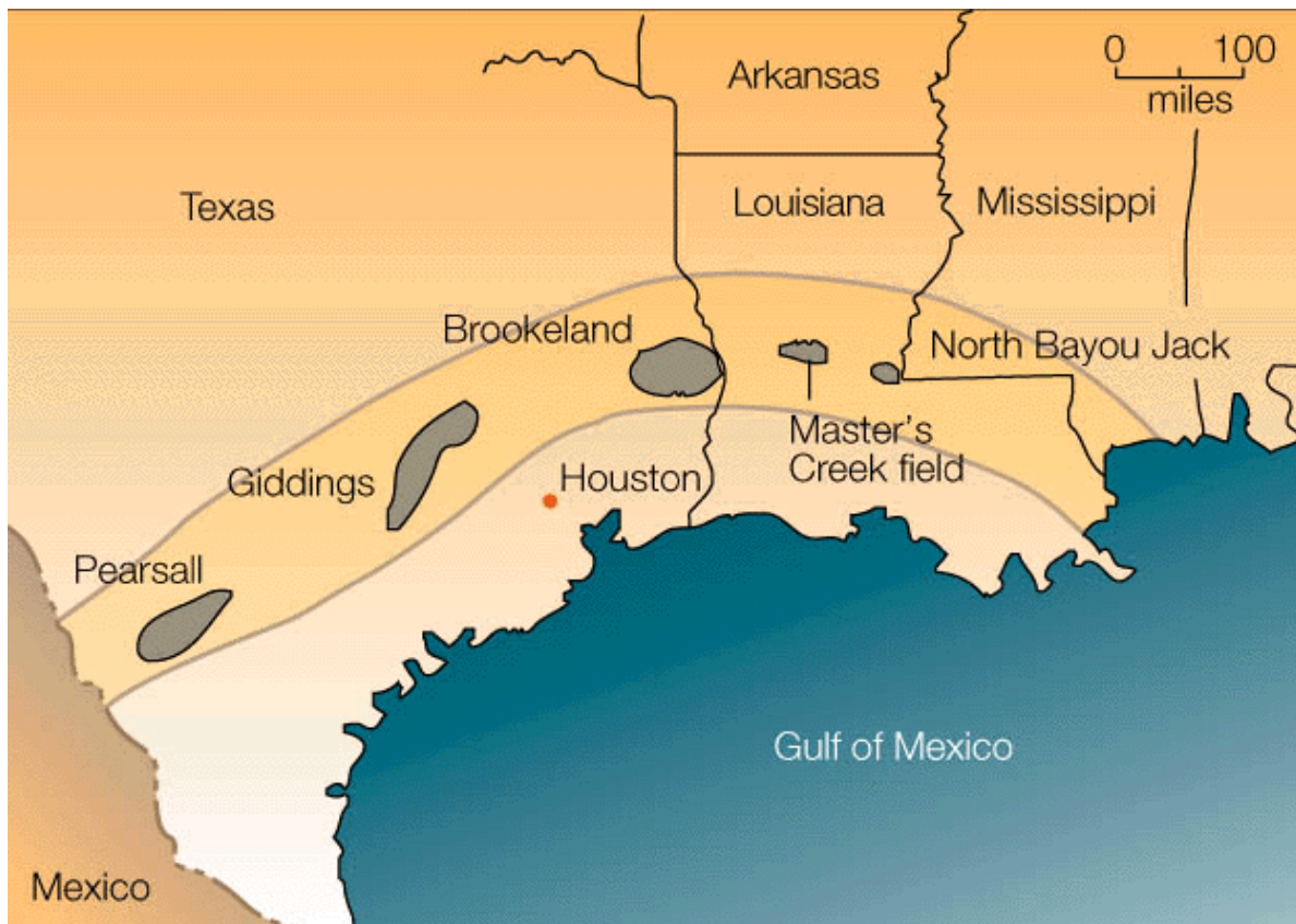
Figure 1: Commercial oil fields within the Austin Chalk trend showing the location of the Brookeland Field to the north-east of Houston.