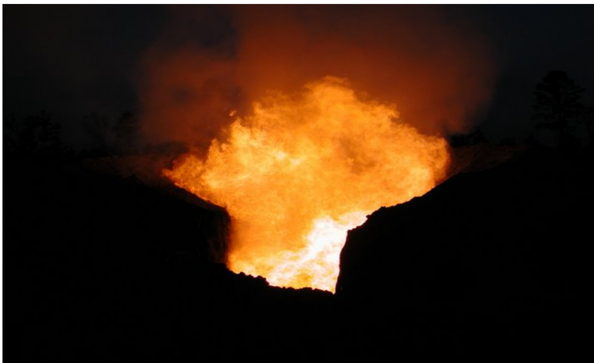
Figure 3: Flare at Vision Rice University VRU#1 demonstrating flow of hydrocarbons.

VRU#1 encountered pressures in excess of 13,000 psi together with the unexpected, presence of an unconsolidated rubble zone which contributed to well bore blockages. These factors combined ultimately lead to the well being plugged and abandoned in September 2009. Future wells will be engineered to accommodate higher reservoir pressures and unconsolidated rubble zones. The operator is confident of mechanical success in future wells and notes that the higher reservoir pressures and presence of unconsolidated rubble zones is particularly positive, typically indicating higher potential reserves and productivity.