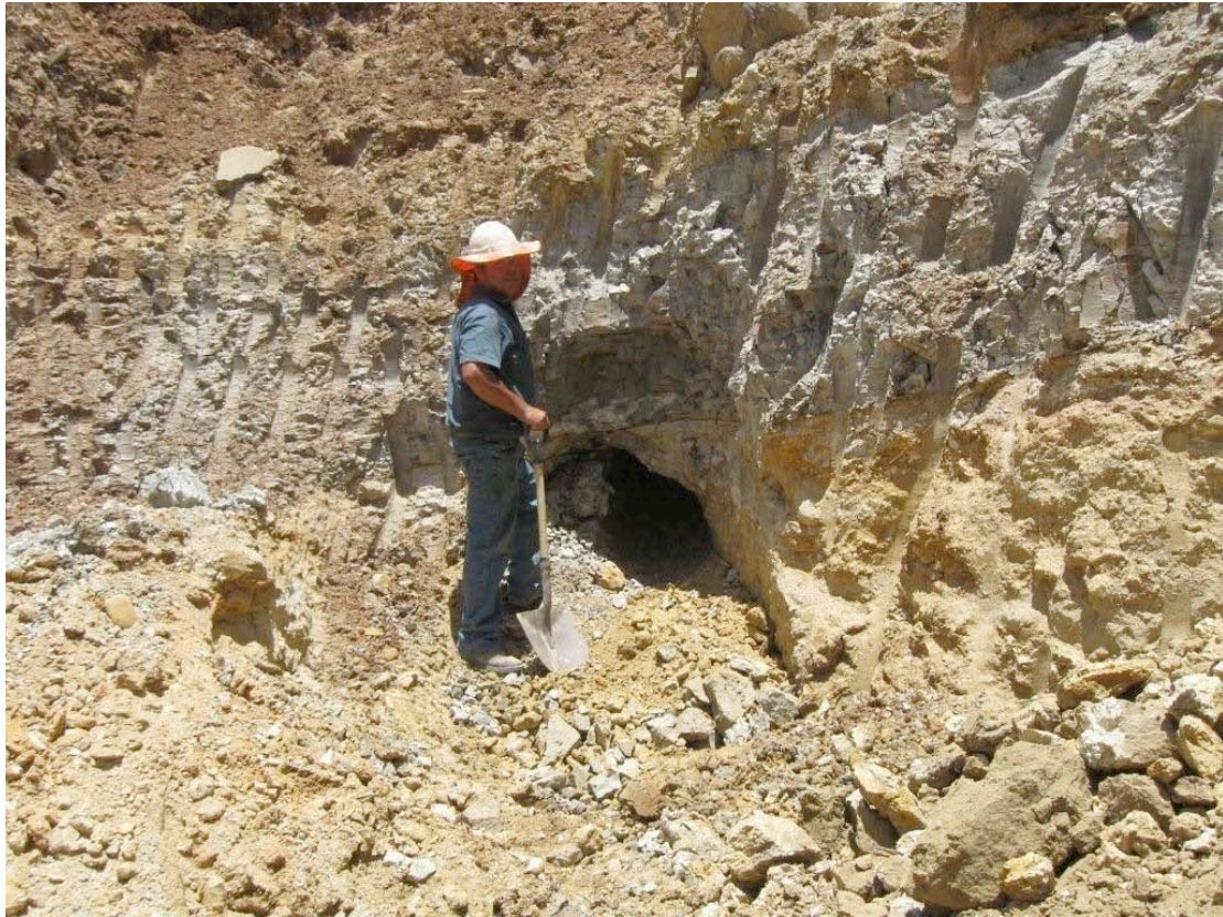
Old Tunnel (located behind stockpile in pit photo)

As the workings extend only to the south and west, it appears the pit is dug on the very edge of these former mine workings.