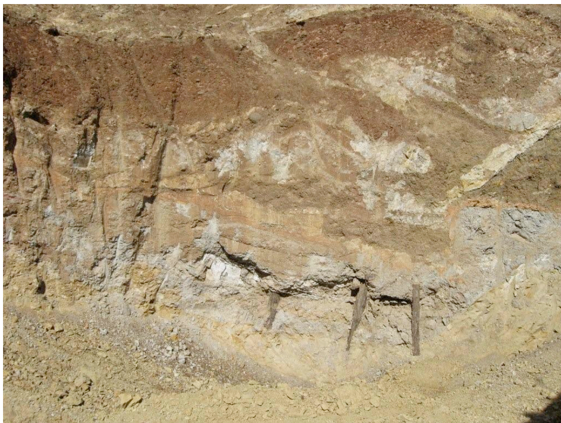
Wooden props in old mine workings