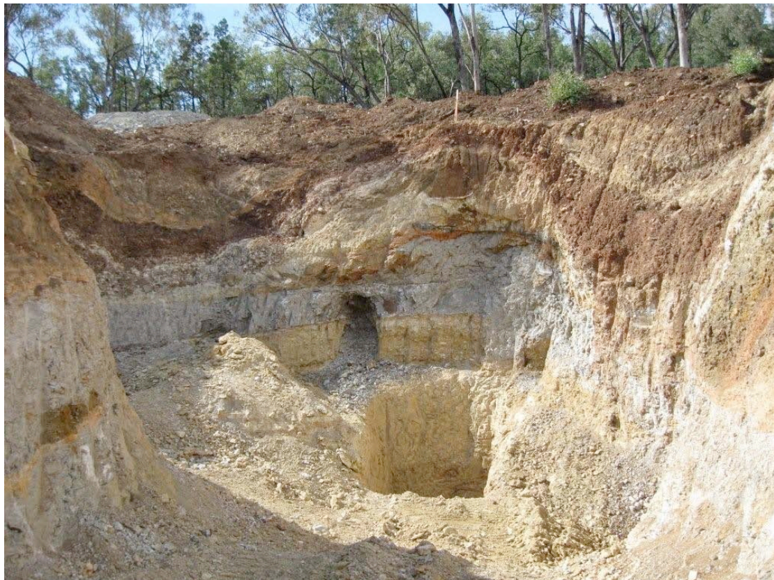
Old diamond mine exposed on Monte Christo Lease

The Monte Christo bulk sampling pit MCR 26 at Bingara has been extended, revealing a network of tunnels continuing to the west and south, and shown below. Three tunnels are present in the far wall, and an old mined area supported by three vertical timber props in the right hand wall.