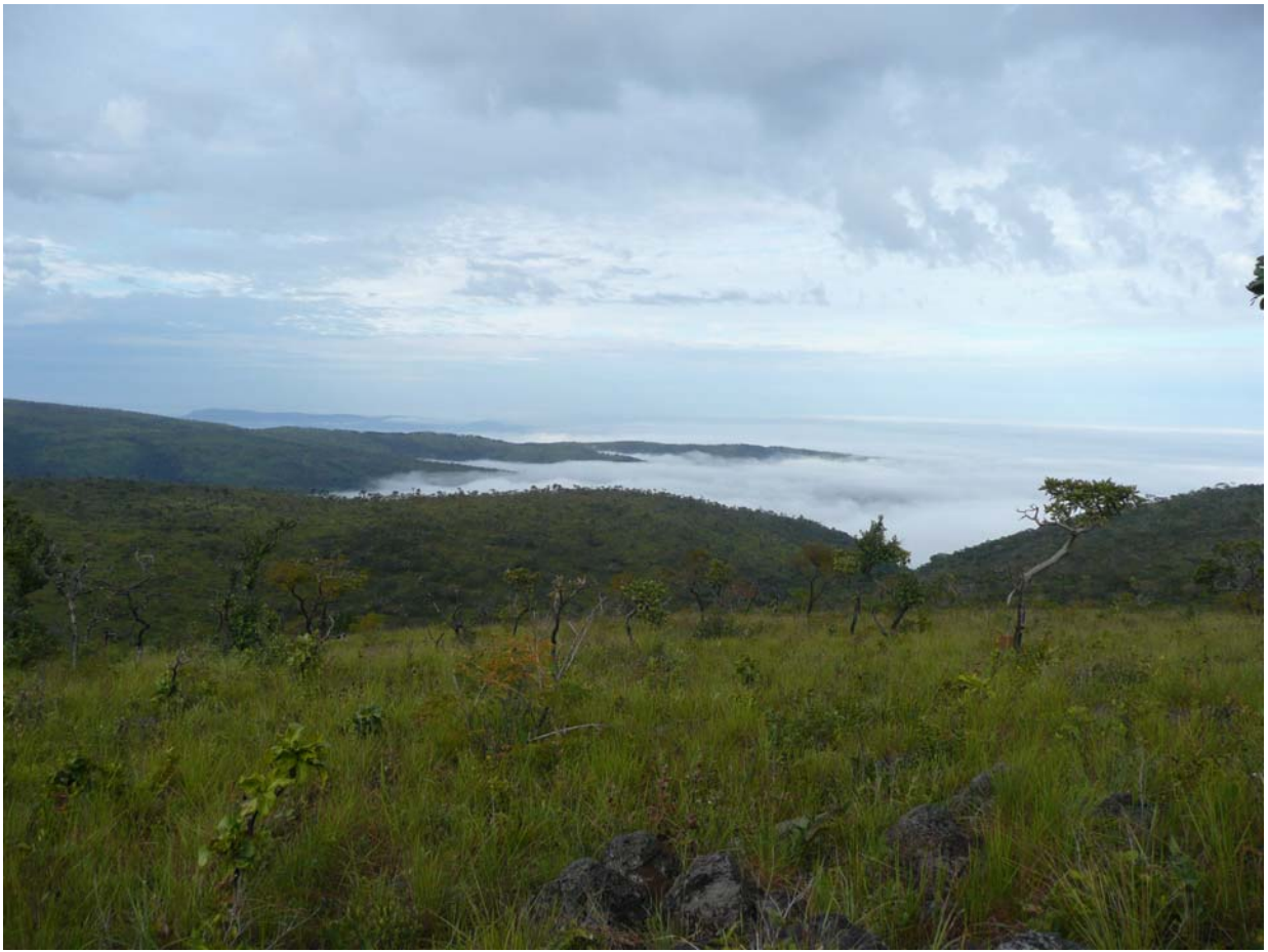
Looking East Into Brazil From the Top of El Mutun