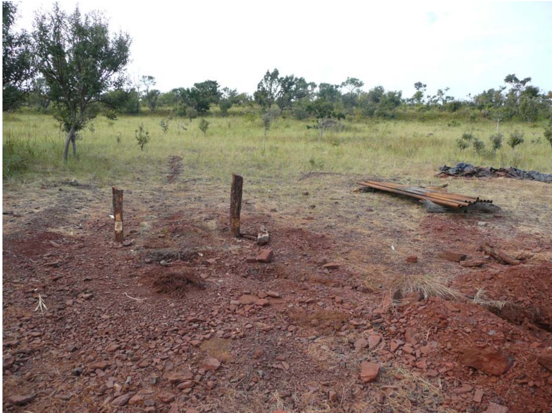
Drilling Site On Top of El Mutun