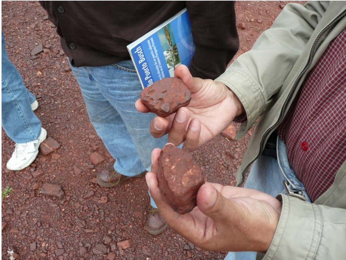
Colluvial Hematite From El Mutun