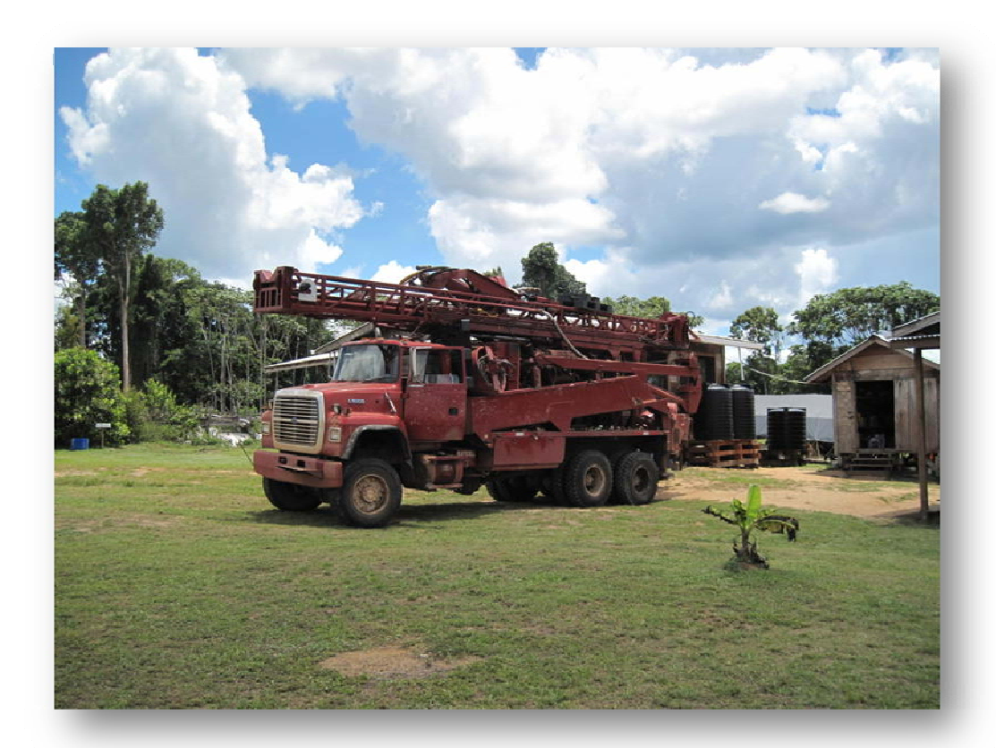
Images of the truck mounted Drilltech D-12 truck mounted rig and support equipment, at the Hicks base camp West Omai Project, Guyana.