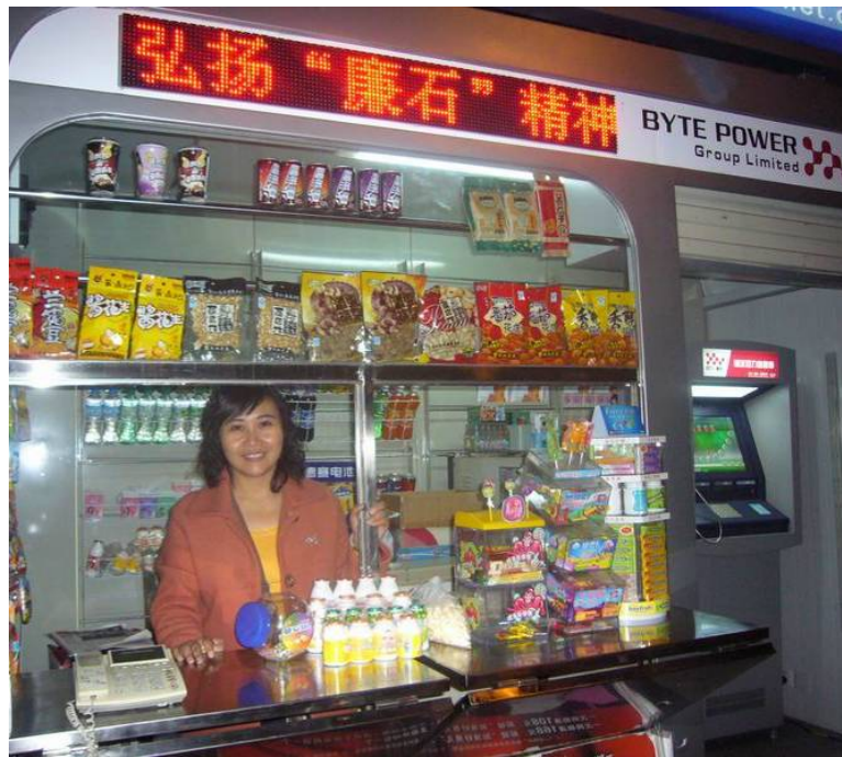
Byte Power e-Kiosk in Chongqing, China