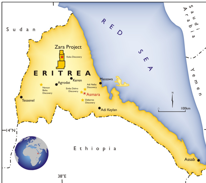
Figure 1 – Zara Project Location Map