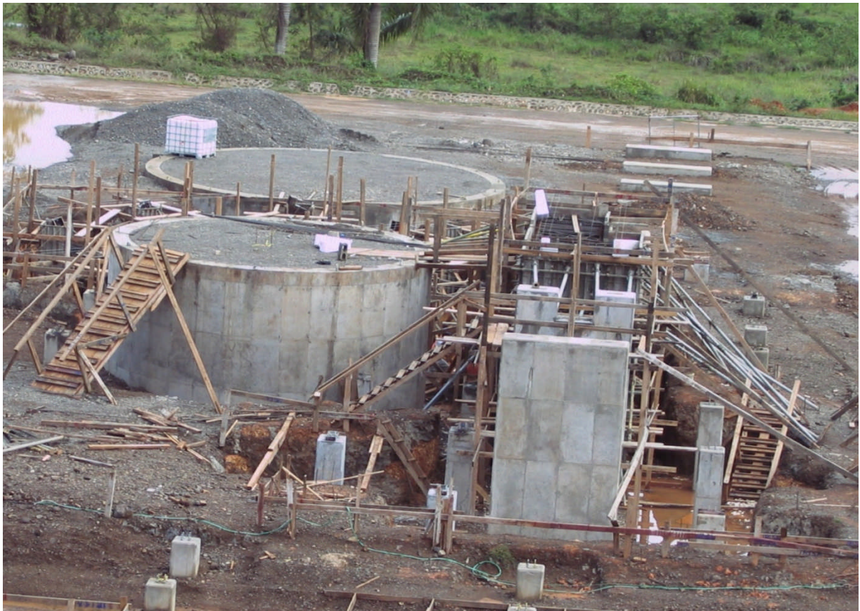
Fine Grinding Foundations