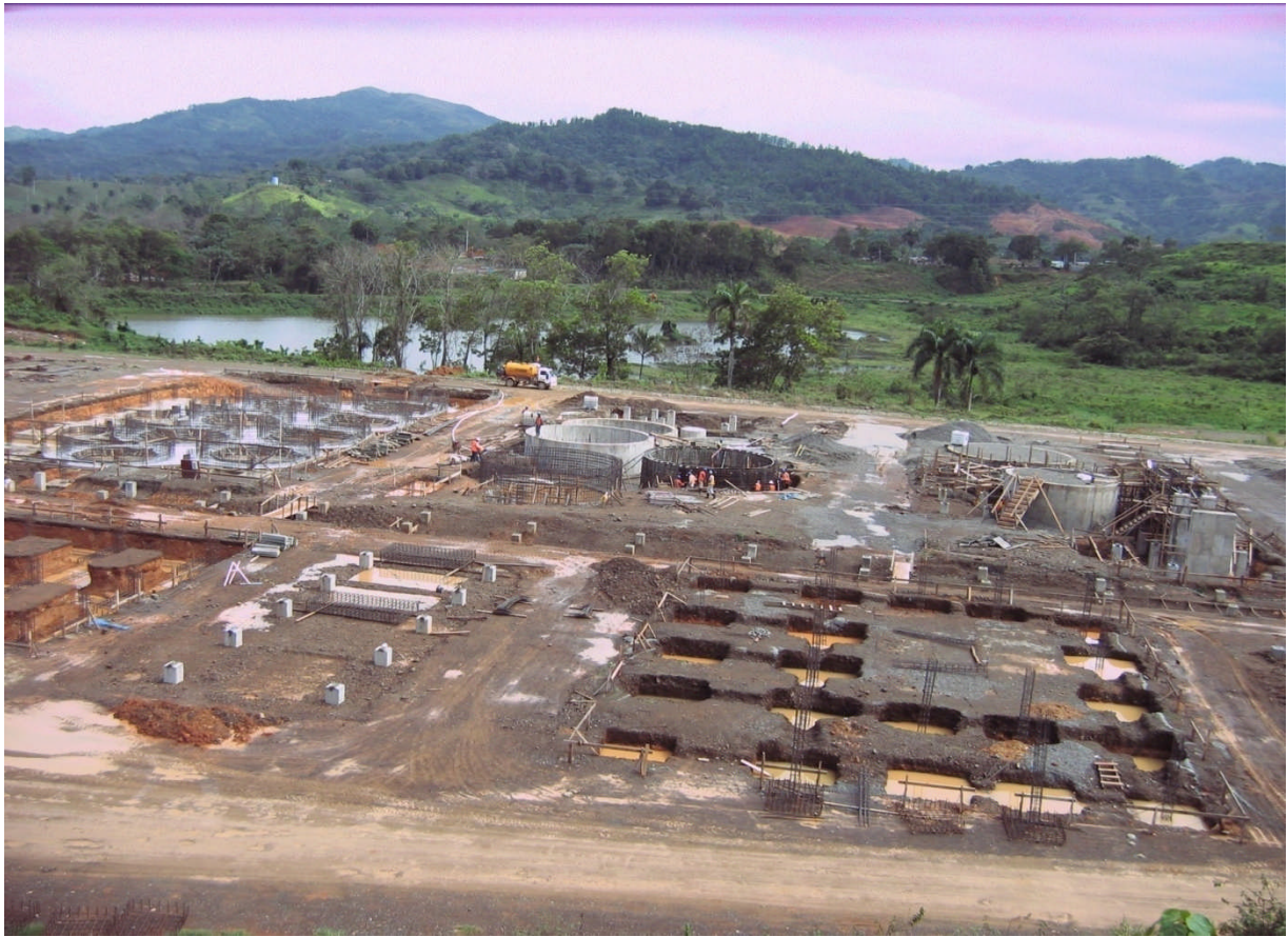
Concrete Foundations Overview