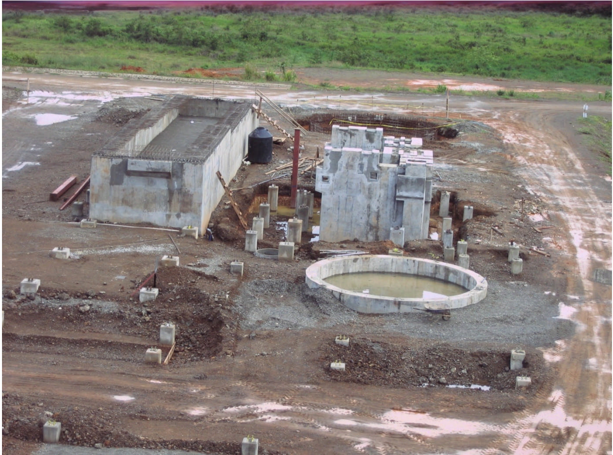
Flotation and Grinding Foundations