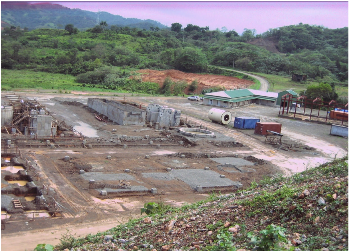
Concrete Foundations Overview