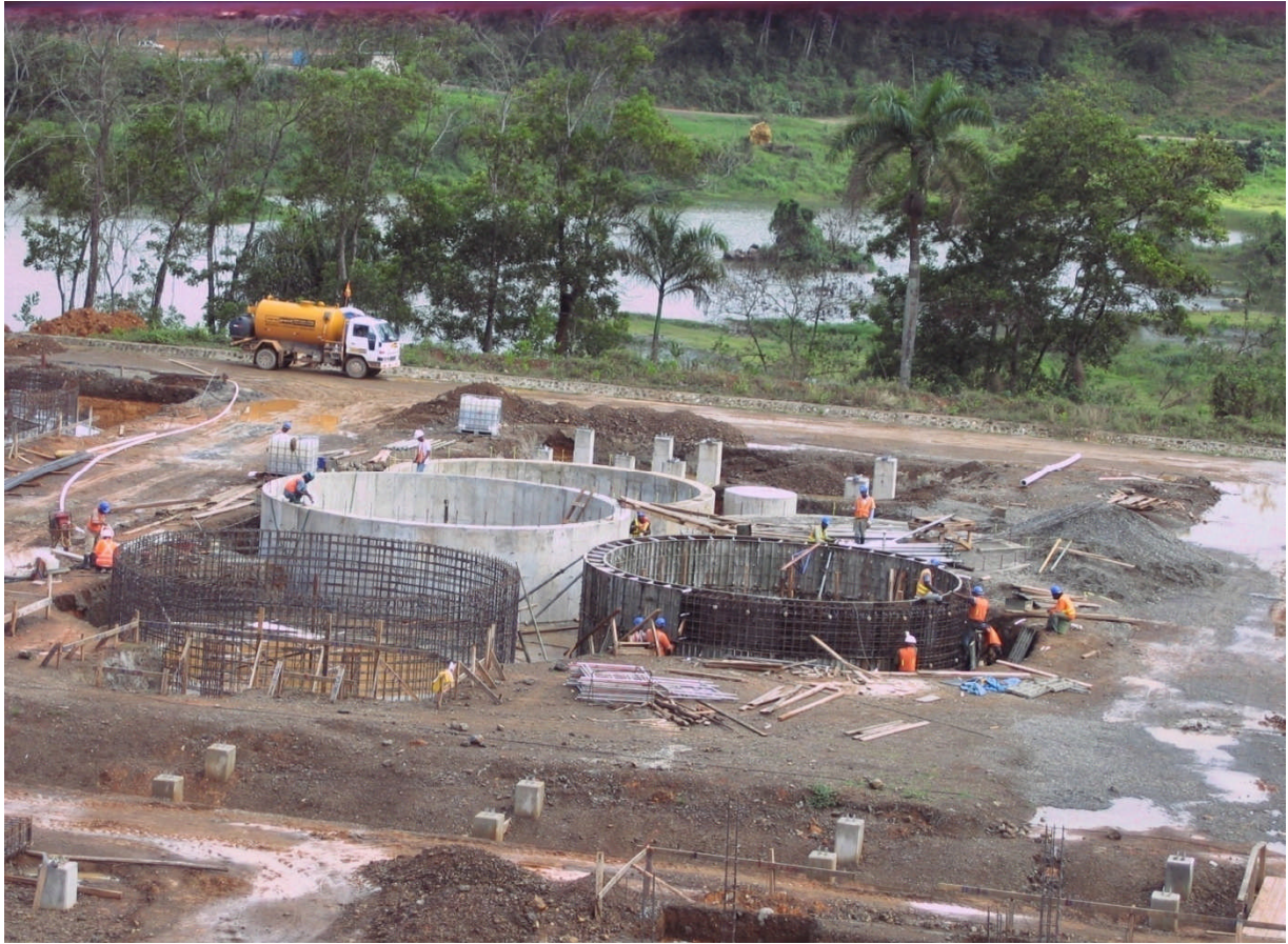
Albion Leach Foundations