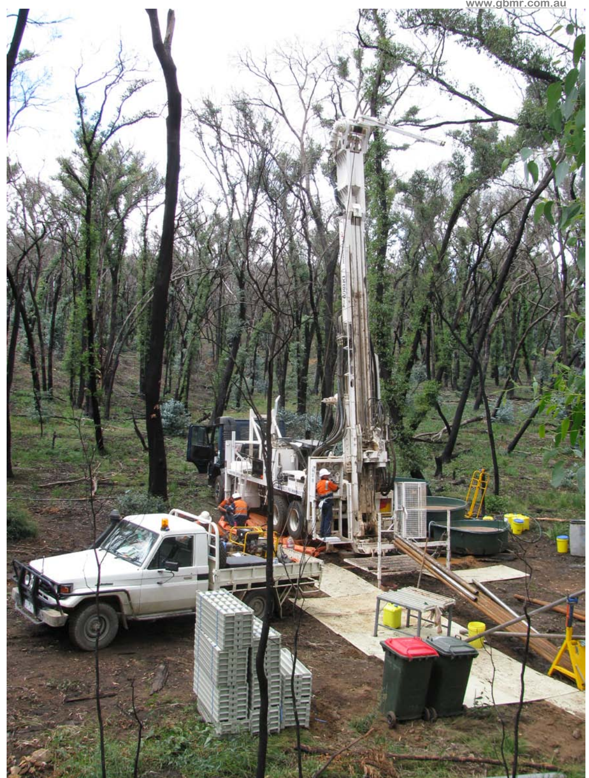
Diamond drilling underway at Belltopper Hill – Malmsbury Gold Project