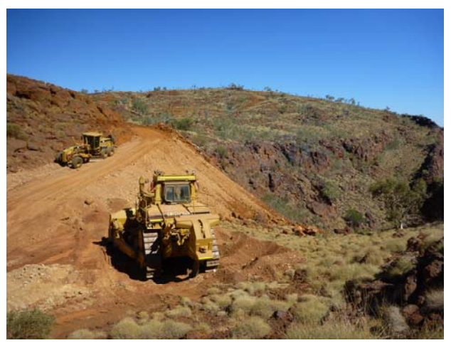
Figure 2: Mt Webber northern access ramp construction.