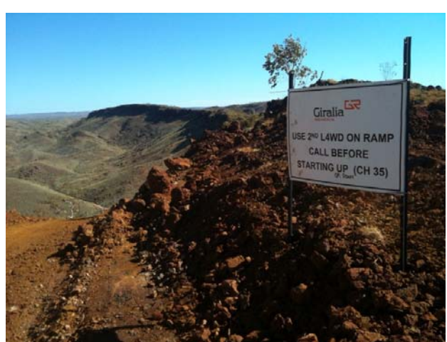
Figure 3: Mt Webber southern access

For further information, please contact: