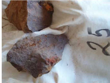
Figure 3 Wubin Goethite-Hematite