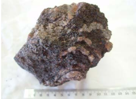
Figure 2 Jubuk Crystalline Magnetite BIF

Preliminary sampling has identified a range of iron ore types varying from coarse grained crystalline magnetite BIF such as encountered at Jubuk (see Figure 2) to more massive goethite-hematite identified at Wubin (see Figure 3). A cemented pisolite type was also identified in two locations at the Wubin project (see Figure 4). The extent of the goethite-hematite and pisolite types of mineralisation has yet to be determined. Samples from these localities are currently being analysed.