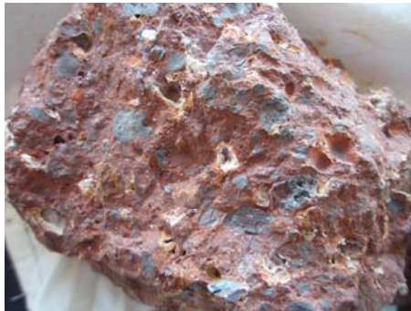
Figure 4 Wubin Pisolite Type

Magnetic is targeting iron ore deposits ranging in size from 220Mt to 1000Mt within its various project areas (see inset in Figure 1) based on interpretation of geophysical data using an assumed specific gravity of 3.5 and projecting the targets to an average depth of 100m below surface. The potential quantity and grade is conceptual in nature as there has not yet been sufficient exploration to define a mineral resource and it is uncertain if further exploration will result in the determination of a mineral resource.