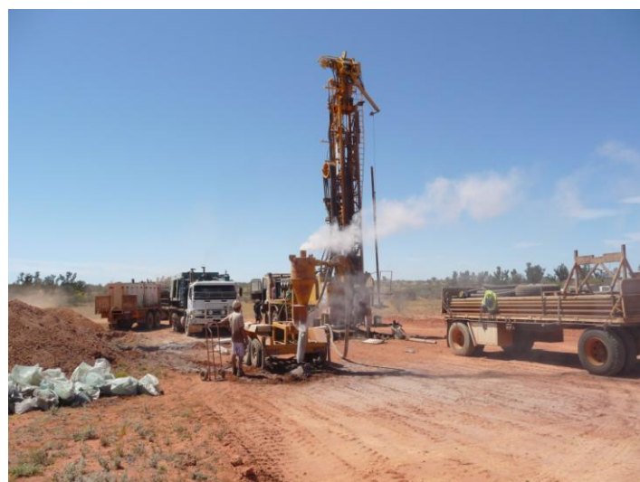
Figure 3: Spudding drillhole AS10D04