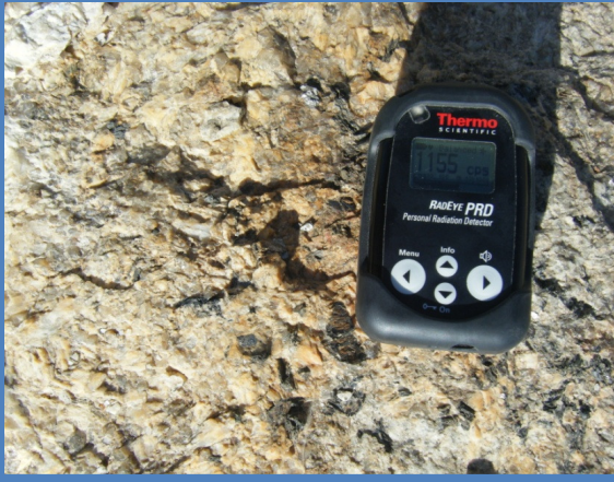
Figure 2: Anomalous granite from target MA6