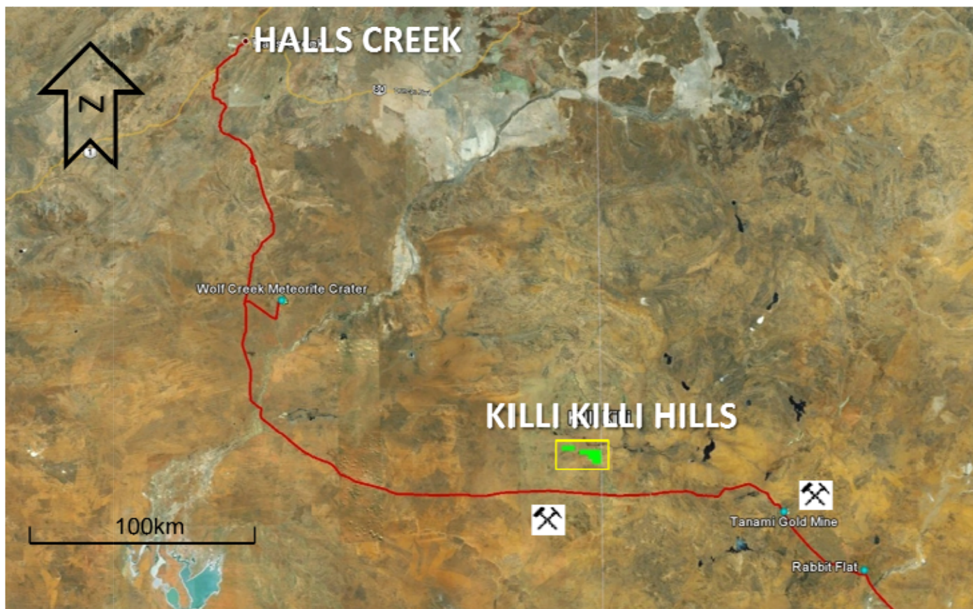
Diagram 3: Halls Creek – Alice Springs Road and the Orion Killi Killi Hills tenements

The Directors believe that the Killi Killi Hills project will be a very attractive addition to Orion's existing Gold and Rare Earth projects at Fulford and Bonner Creek in North Queensland and will complement the company's ongoing strategy to develop HREE and gold opportunities.