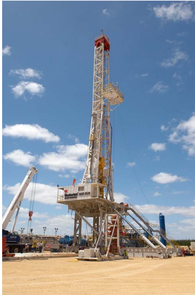
Rig 828 Le Tourneau Lightning Rig, as operated by Weatherford Drilling International.

The completion of the drilling operations brings Panax one step closer to realising the benefits of the Penola Geothermal Project.