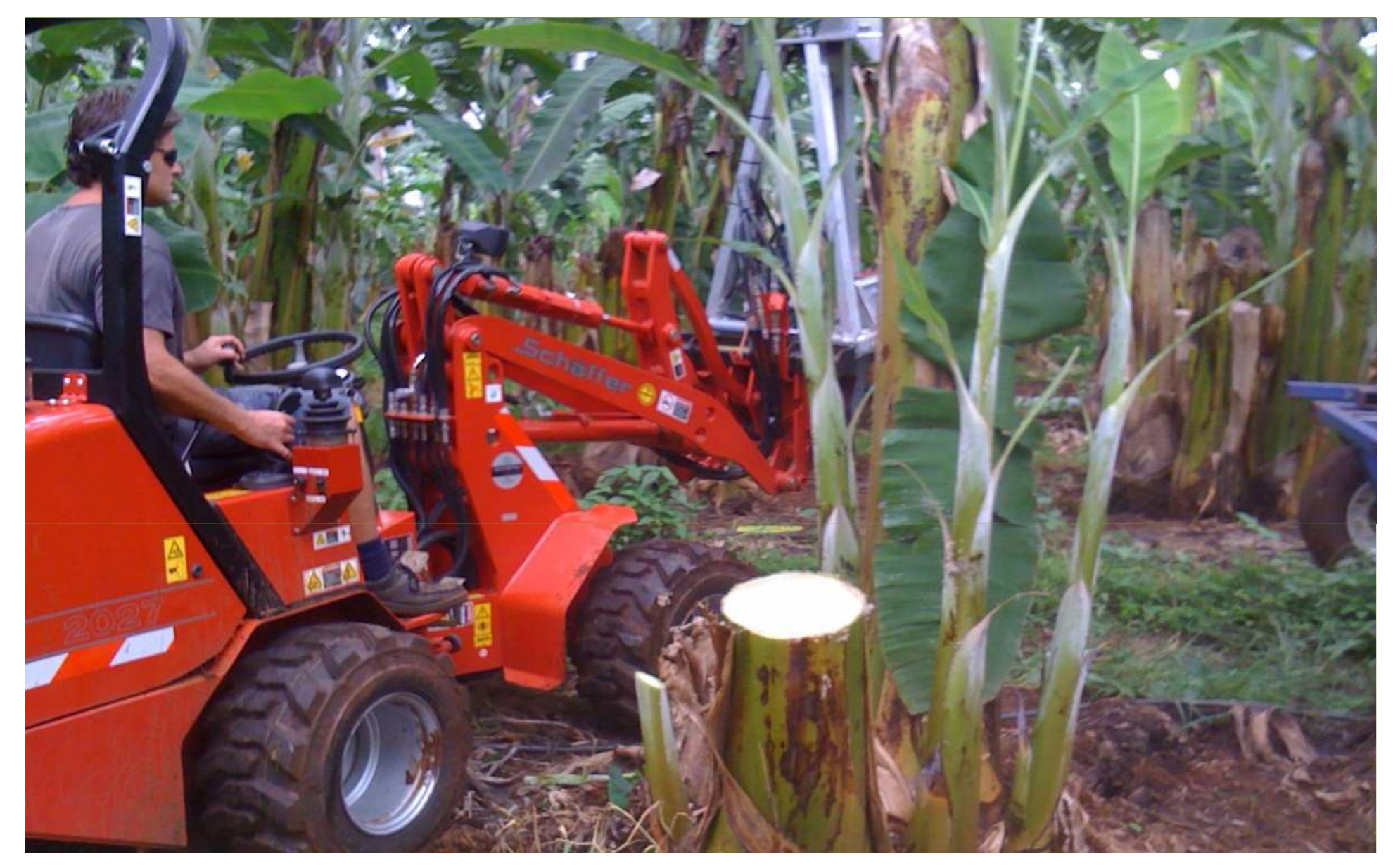
HARVESTED TREE WITH A MATURE BUNCH CARRYING TREE (TO BE AVAILABLE FOR HARVESTING IN 6 MONTHS) AND 3 SUCKERS (ONLY ONE WILL BE CHOSEN TO SURVIVE)