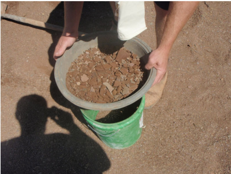
Figure 4: Sampling at Wearing Gorge