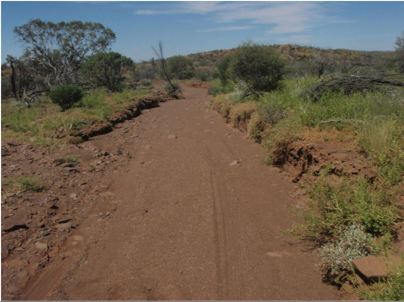
Figure 3: Typical stream at Wearing Gorge

A stream sediment sampling program was carried out last quarter and the results are pending.