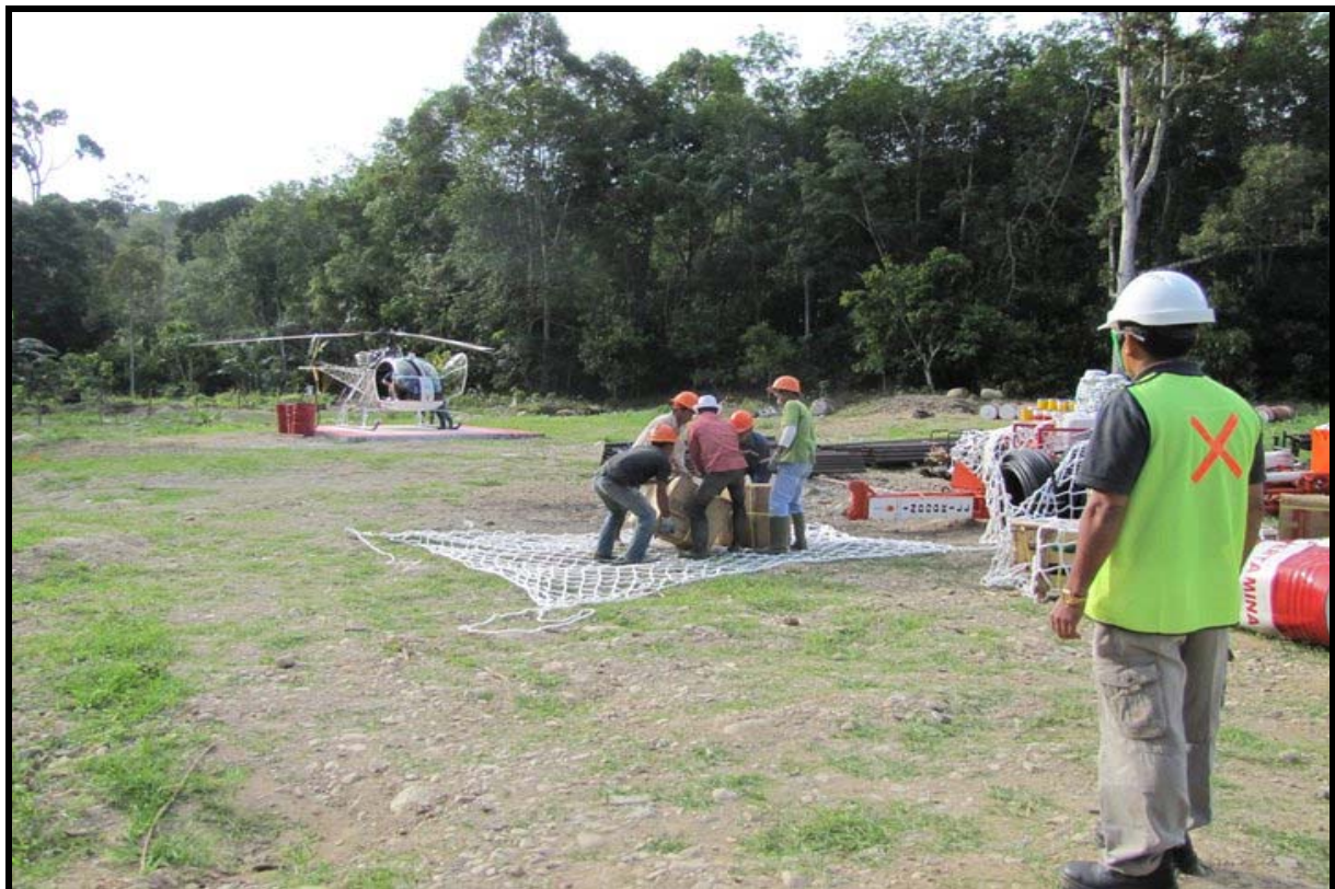
Staging area prior to moving the drilling rig.

A man portable drilling rig has now been mobilised to site by helicopter. The first hole will be sited on the best surface outcrops at the Company's Sontang East manto discovery which returned channel samples of 20.2 metres @ 2.59 g/t Au, 56.9 g/t Ag, 0.16% Pb and 8.4% Zn.