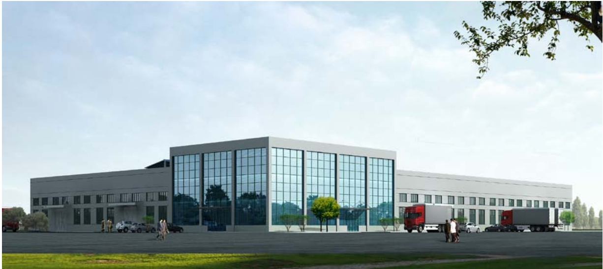
Conceptual Drawing of Stage 2 Nanjing Facility

Vmoto is also in discussion with local Chinese Government authorities to acquire an additional adjoining parcel of land, totalling approximately 43,000 square metres, which would allow for further expansion of the Nanjing Facility as production continues to grow.