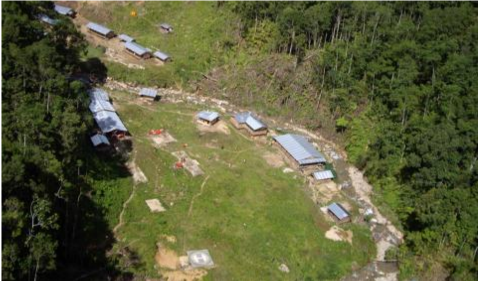
Ariel view of Nancy camp – Malala Project