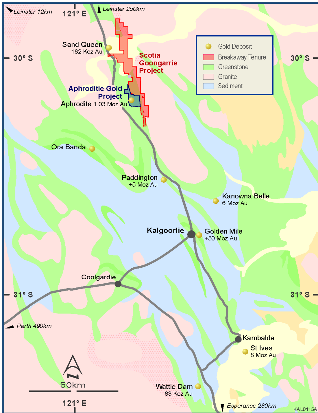
Figure 1: Location of Aphrodite and Scotia JV Projects