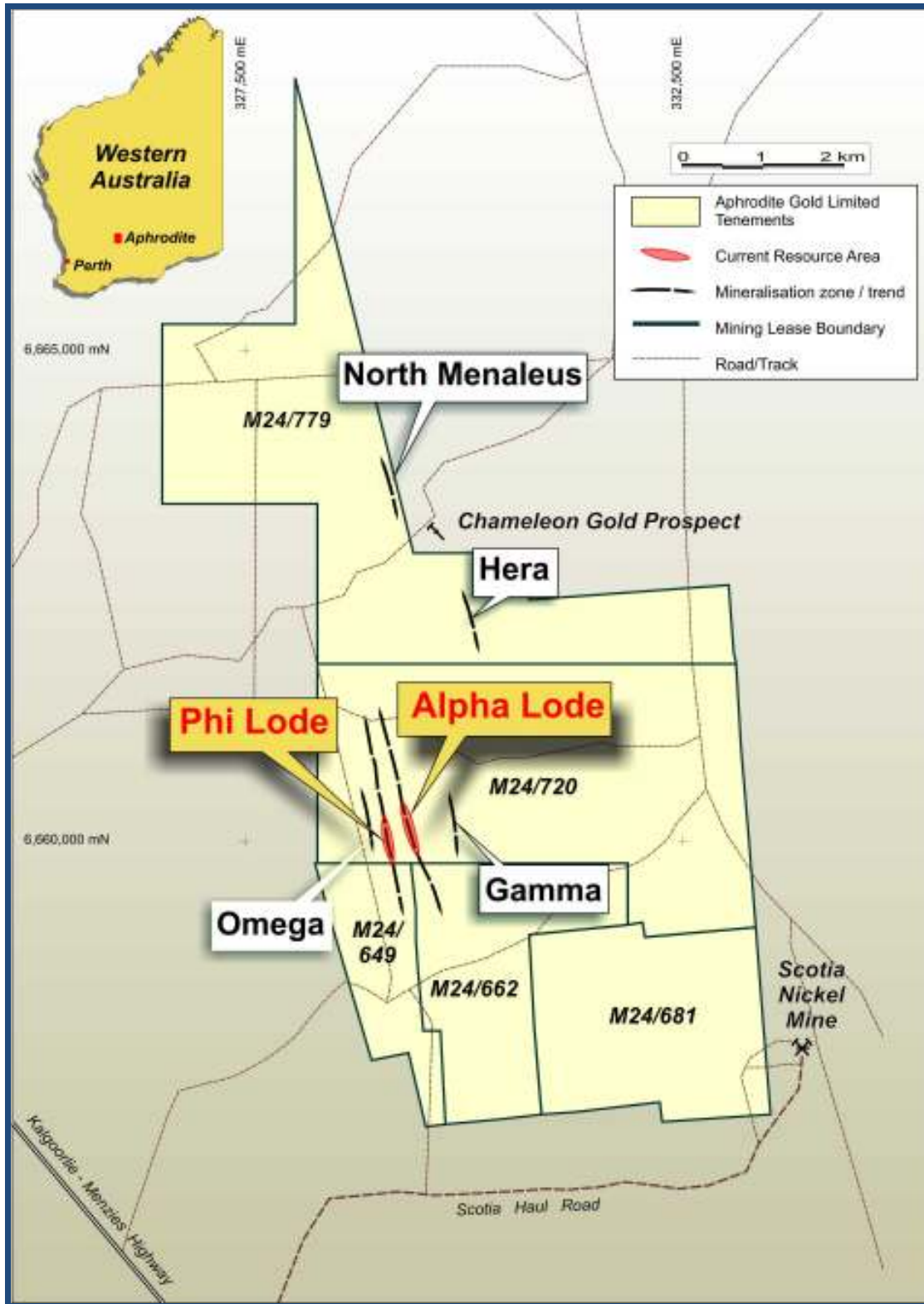
Figure 3: Aphrodite's Gold Tenements Showing Hera and Other Gold Prospects, and the Chameleon Gold Prospect on the Scotia JV Ground.