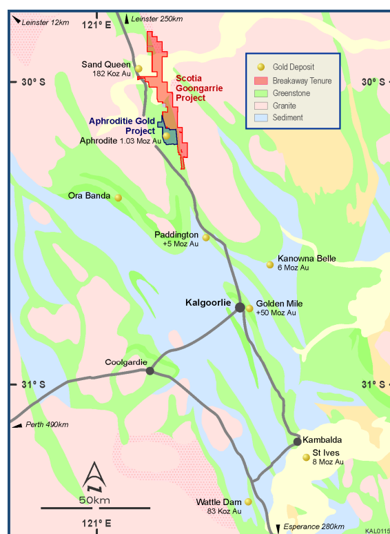
Figure 1: Scotia Project Location Plan

Mineralisation remains open both at depth and along strike with numerous significant intersections returned to date including 29m @ 3.40g/t Au from 124 metres in GG382, 22m @ 5.43g/t Au from 150 metres in GG390, and 8m @ 3.39g/t Au from 202 metres in GG401.