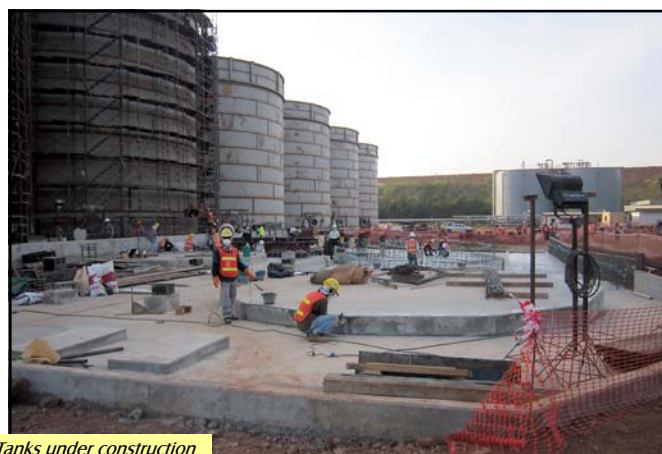
Grinding Plant and Elution Tanks under construction