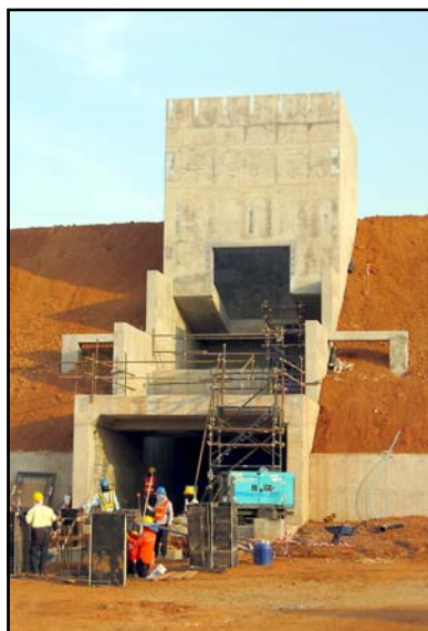
Primary Crusher (No.2) under construction

For the half year, unrealised non-cash foreign exchange losses on intercompany loans and costs associated with the two outstanding corporate transactions are expected to have an adverse impact of around A$13 million on the December 2010 half year profit.