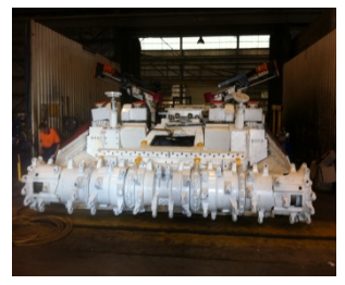
30MB3 Continuous Miner