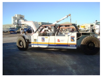
Brumby tool carrier