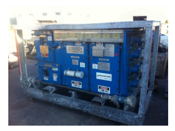
Two Distribution Control box – 1000V 8 outlet