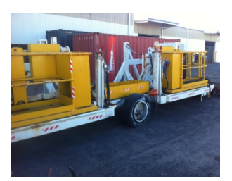
Trailer - Pipe trailer