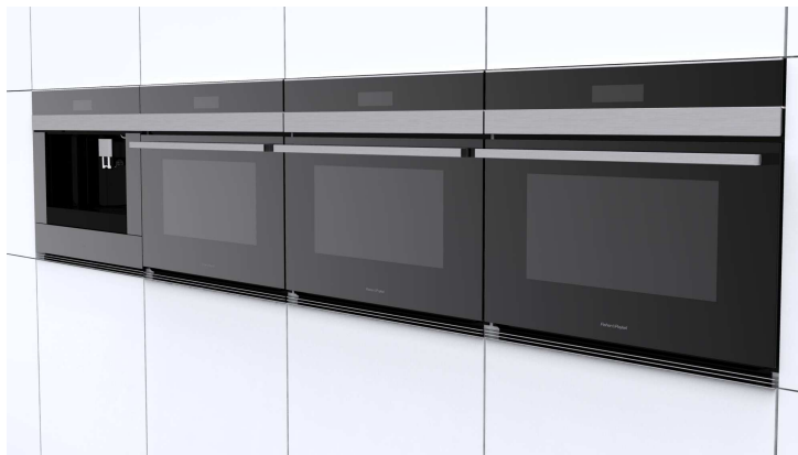
Companion Products – December 2011