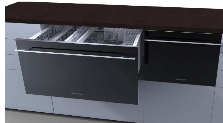
Phase 7 – DishDrawer Dishwasher – December 2011