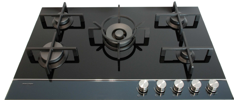
Gas on Glass Cooktop – March 2012