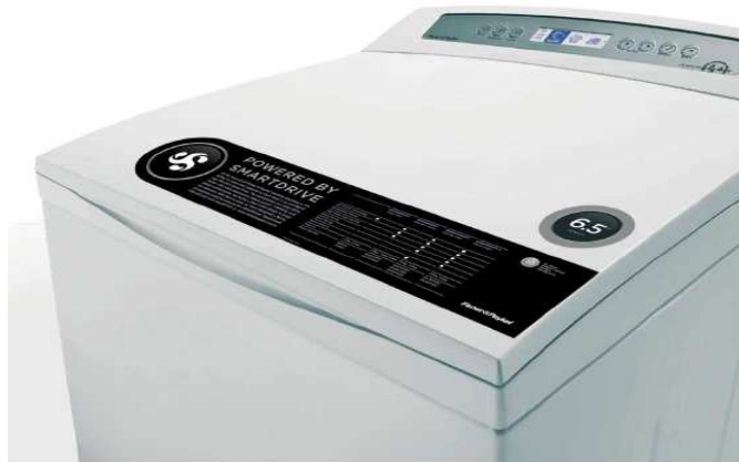
Washing Machines – Aus & NZ – June 2011