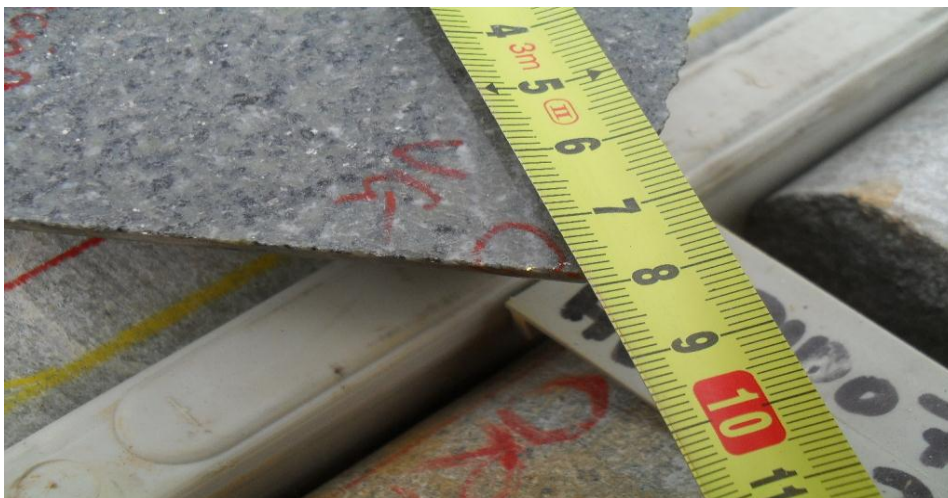
Visible Gold and Strong Alteration in Reliance drillhole RLD1006

A summary of the drilling results are listed on the following page.