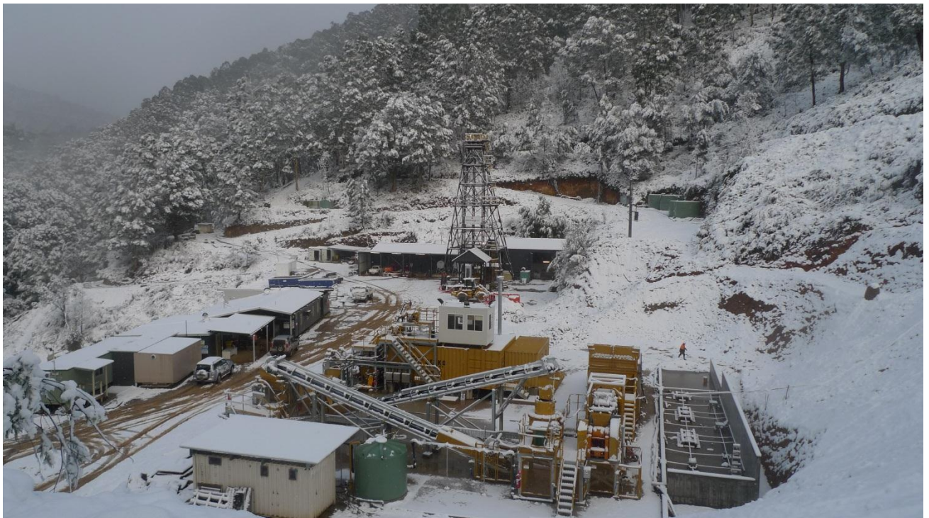
Morning Star Goldmine site under show during the June Quarter