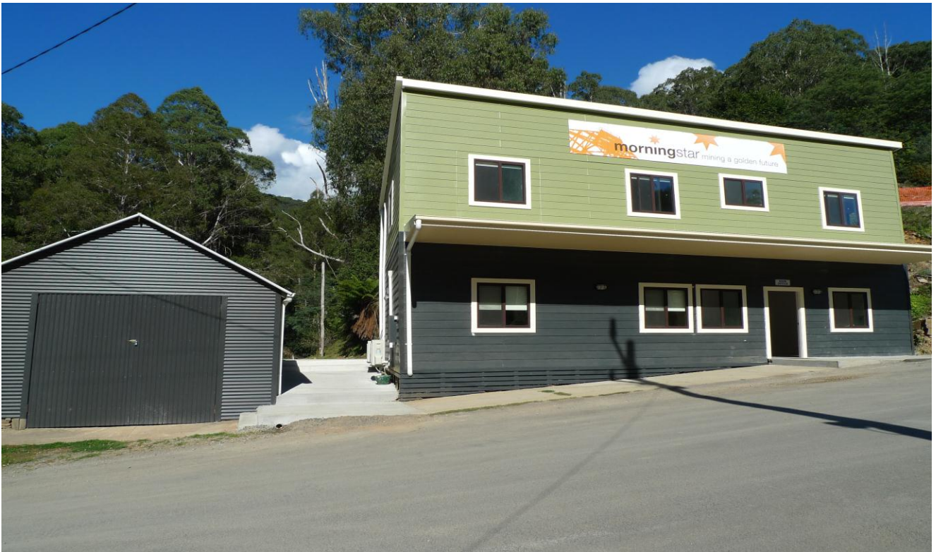
MCO's new Woods Point HQ is open just 500 metres from mining and milling operations (MIN 5009)

We will also drill the Burns zone (~165m depth) and set up underfoot drilling from 10 Level (~310 metres depth) into the 'Gap Zone' of the mine. The zone is explained in the corporate video more fully. Mining and milling of ore from Maxwell zone will be held back until June due to shaft work, winder certification and drilling priorities.