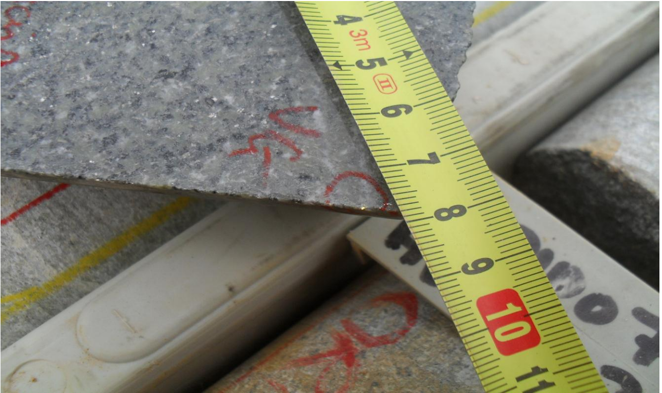
Drill core with visible gold - Hole 6 (85m downhole) at the Reliance dyke prospect near Gaffneys Creek (EL 5079)

More comprehensive project news is due out around the time of the quarterly reporting recap and we are working hard to an existing plan to ensure mining, exploration, infrastructure and milling operations are tracking at the fastest possible pace in the safest possible manner.